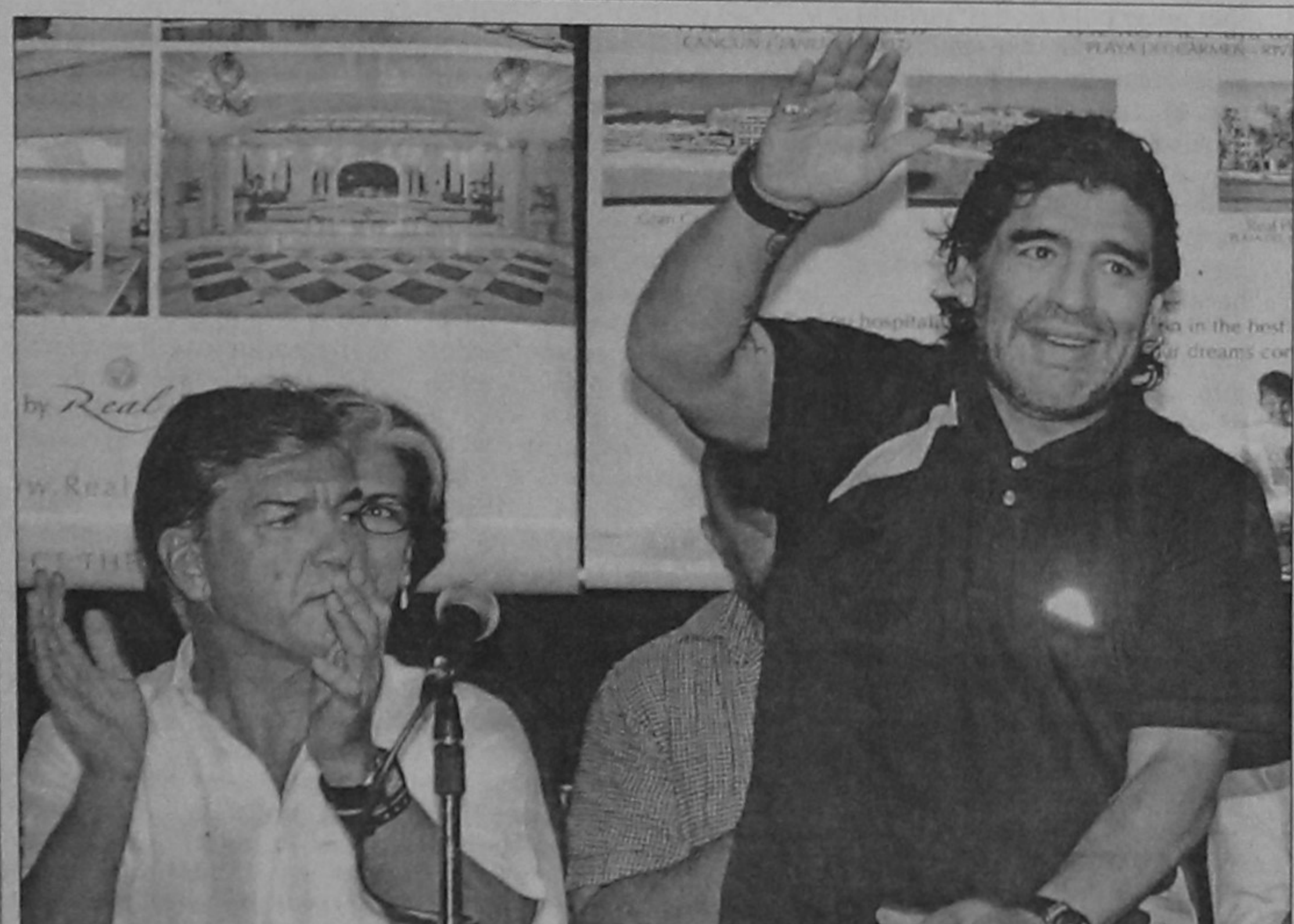
Argentine football legend Diego Armando Maradona (R) waves during a press conference in Cancun, Mexico on Friday.

"People can say what they want," he added. "Let's just say I am above my usual weight, but that is normal. That isn't surprising - I have gone five months without training. There is nothing illogical about putting on a few kilos. They can say what they want, it doesn't bother me. I am going to continue to work hard and to look to reach my goal, to get back playing football. Like before."