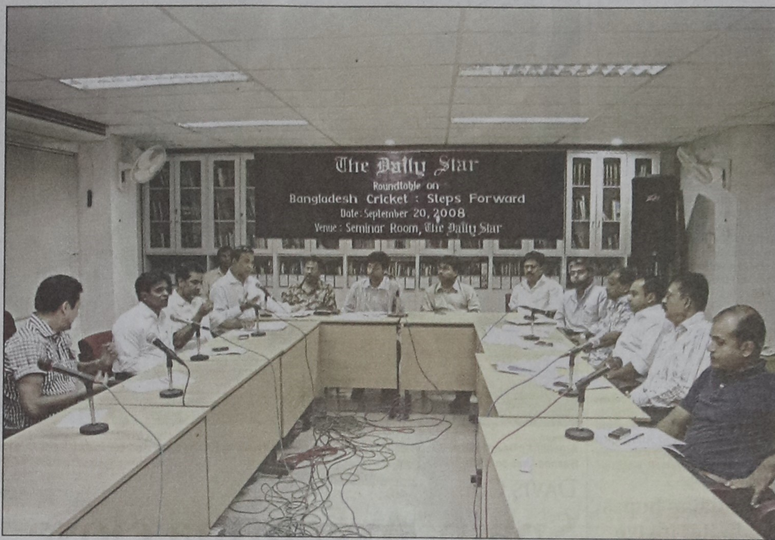
Participants of The Daily Star organised roundtable titled 'Bangladesh Cricket: Steps Forward' at its office in Karwan Bazar yesterday.