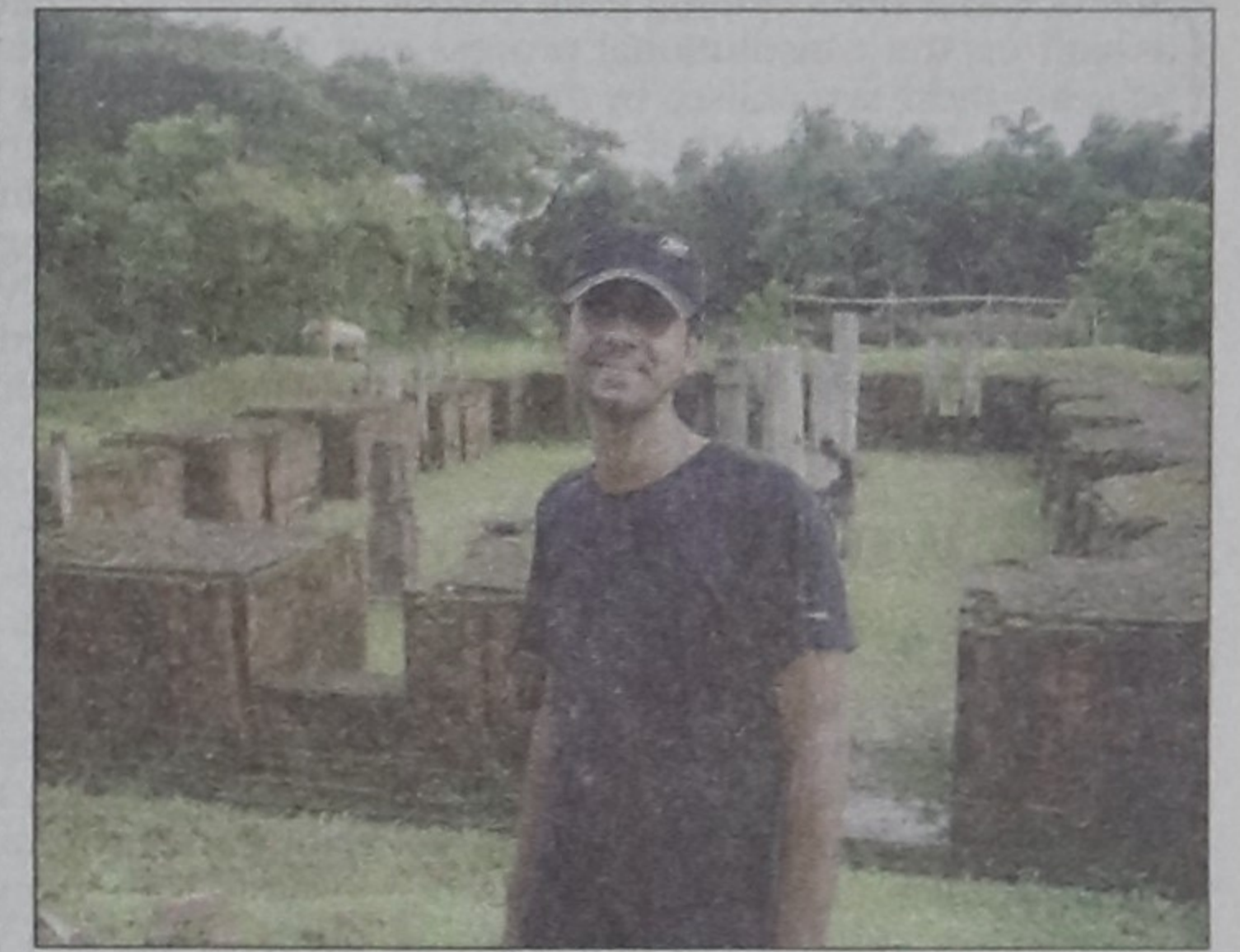
A scene from the travel show.

there. The show also includes road directions, interesting sites as well as unknown spots of a district, interviews of the local people and quiz for the audience. This episode of Banglar Pothey will focus on the district Netrokona. A production of Thematic production house, the show is directed and hosted by Hasan Imam Choudhury Tinku.