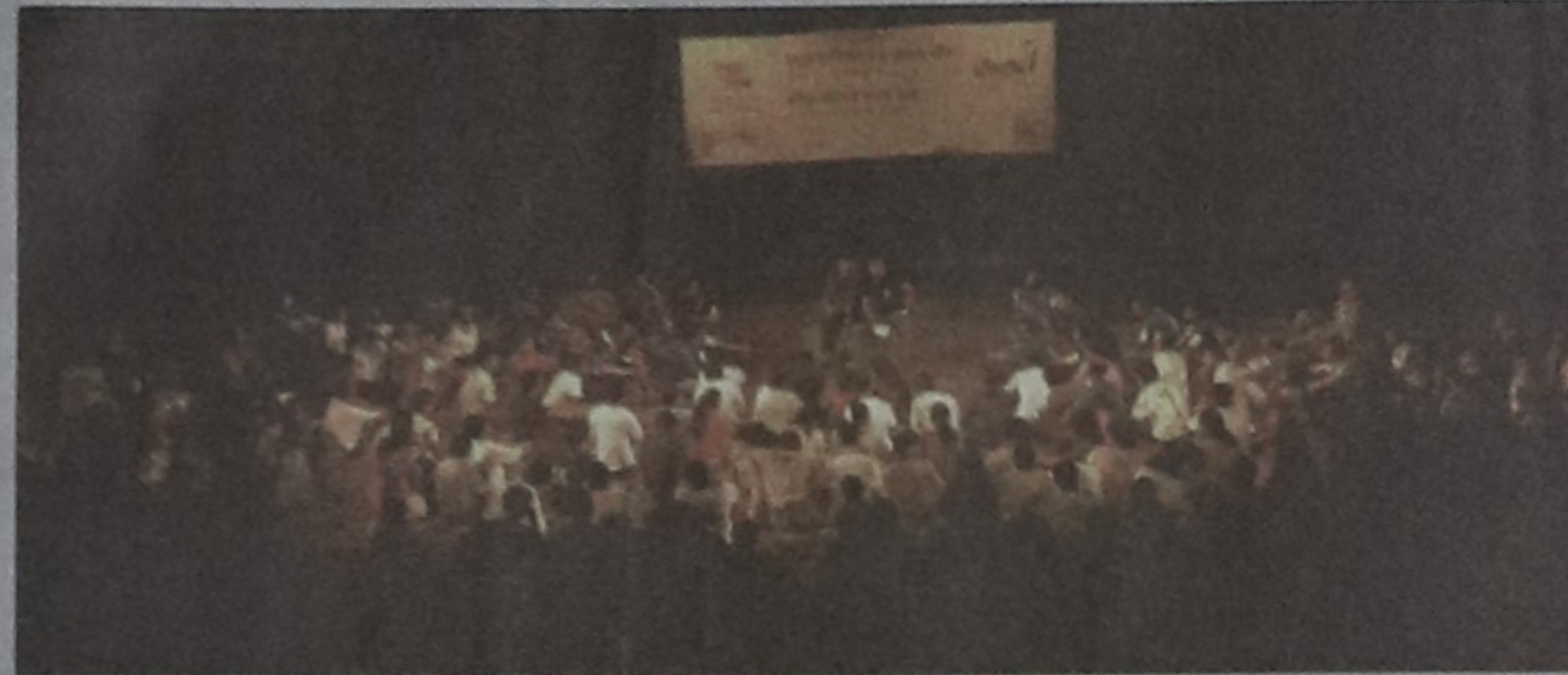
Discussants at the event.