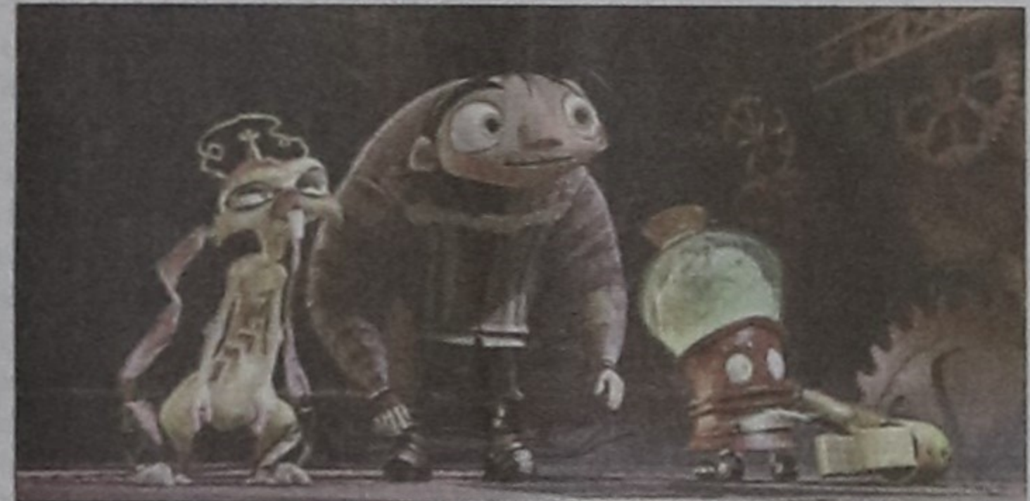
John Cusack is the voice of the lowly misfit with a dream in "Igor".

No animated horror spoof in which Eddie Izzard voices a bad guy named Dr. Schadenfreude can be a total loss. Not even "Igor" pieced together from Tim Burton and various other sources with more desperation than inspiration.