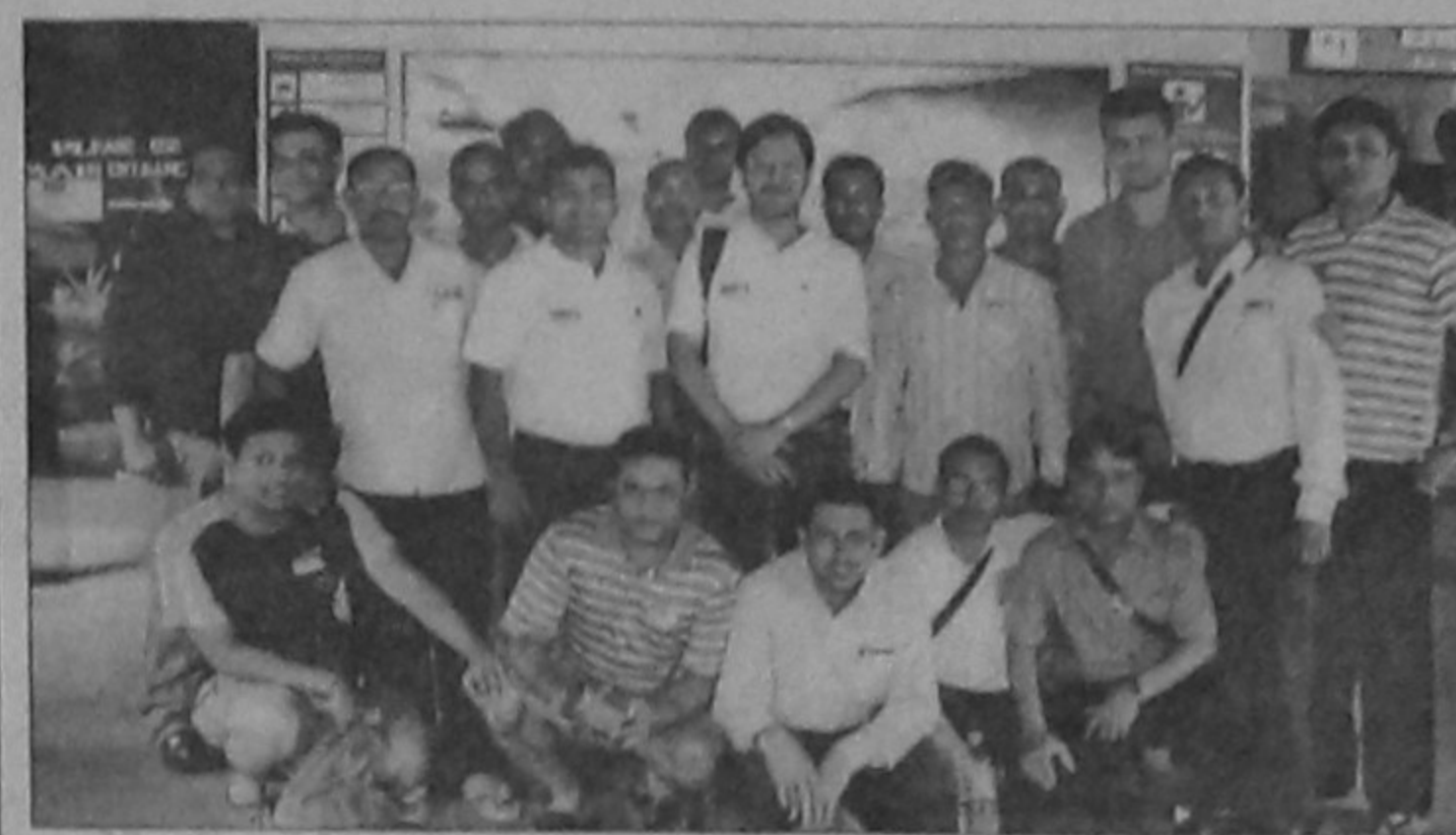
Bergers Paints Bangladesh Ltd (BPBL) has recently arranged a trip for its 20 dealers to Singapore and Malaysia in recognition of their business performance. BPBL officials and dealers pose for a photograph in Singapore.

The Federal Reserve's 80 percent purchase of giant insurer American International Group (AIG) on Wednesday failed to shore up market confidence, as banking shares continued to