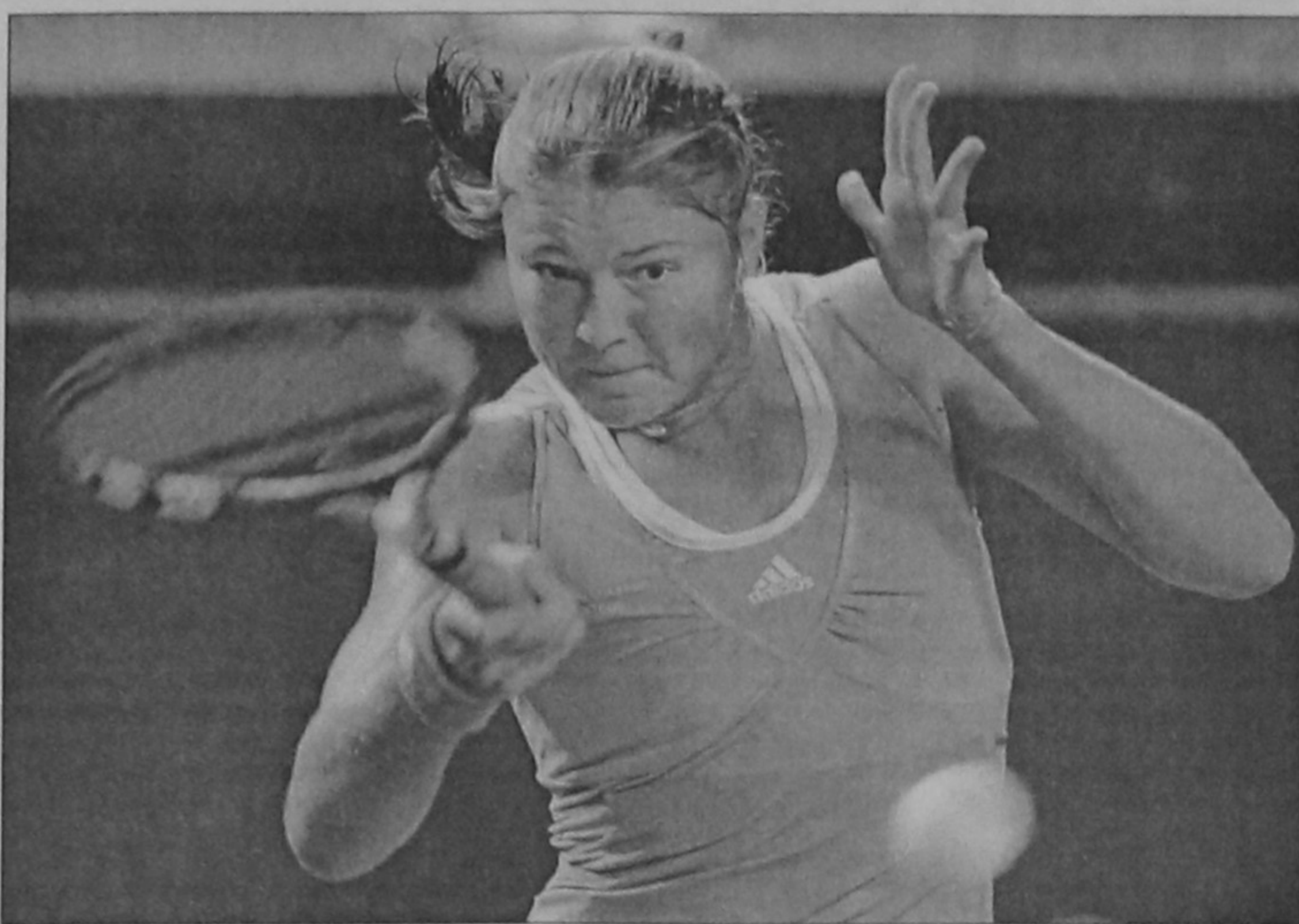
Dinara Safina of Russia makes a forehand return against Dominika Cibulkova of Slovakia during their second round match of the Pan Pacific Open in Tokyo on Wednesday.

"Morale-wise it is not a great thing to happen. But I prefer to lose 3-0 than to lose 1-0 three times."