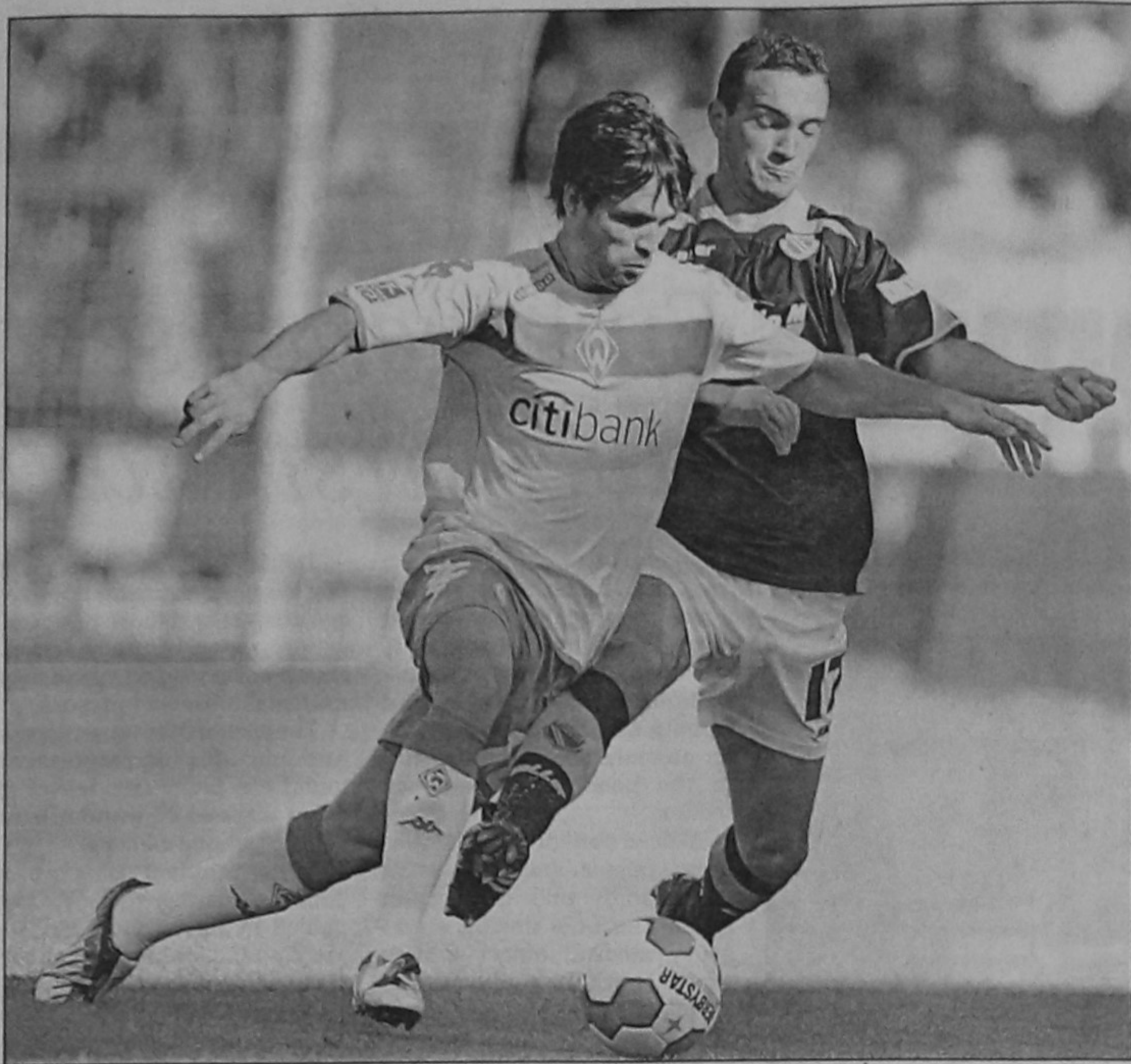
Werder Bremen star Diego (L) is challenged by Cottbus' Daniel Ziebig during their Bundesliga encounter at the Weserstadion in Bremen on Saturday.

On the importance of winning the Champions League, Adriano said: "We have a very strong desire to win it this year. Because everyone asks for it, especially the fans. We have a great chance to win, because we have a lot of good players and I think that if we work hard every day, we can make it. Against Werder I have very good memories and I hope to continue doing well..."