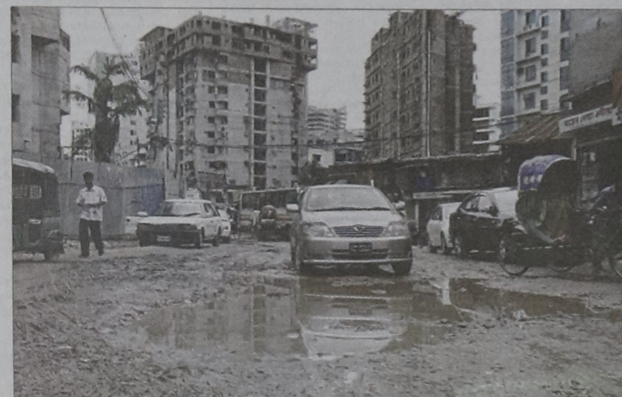
Vehicles try to avoid potholes of the muddy Arambagh-Bijoy Nagar Road in the city. The deep potholes have caused several accidents.