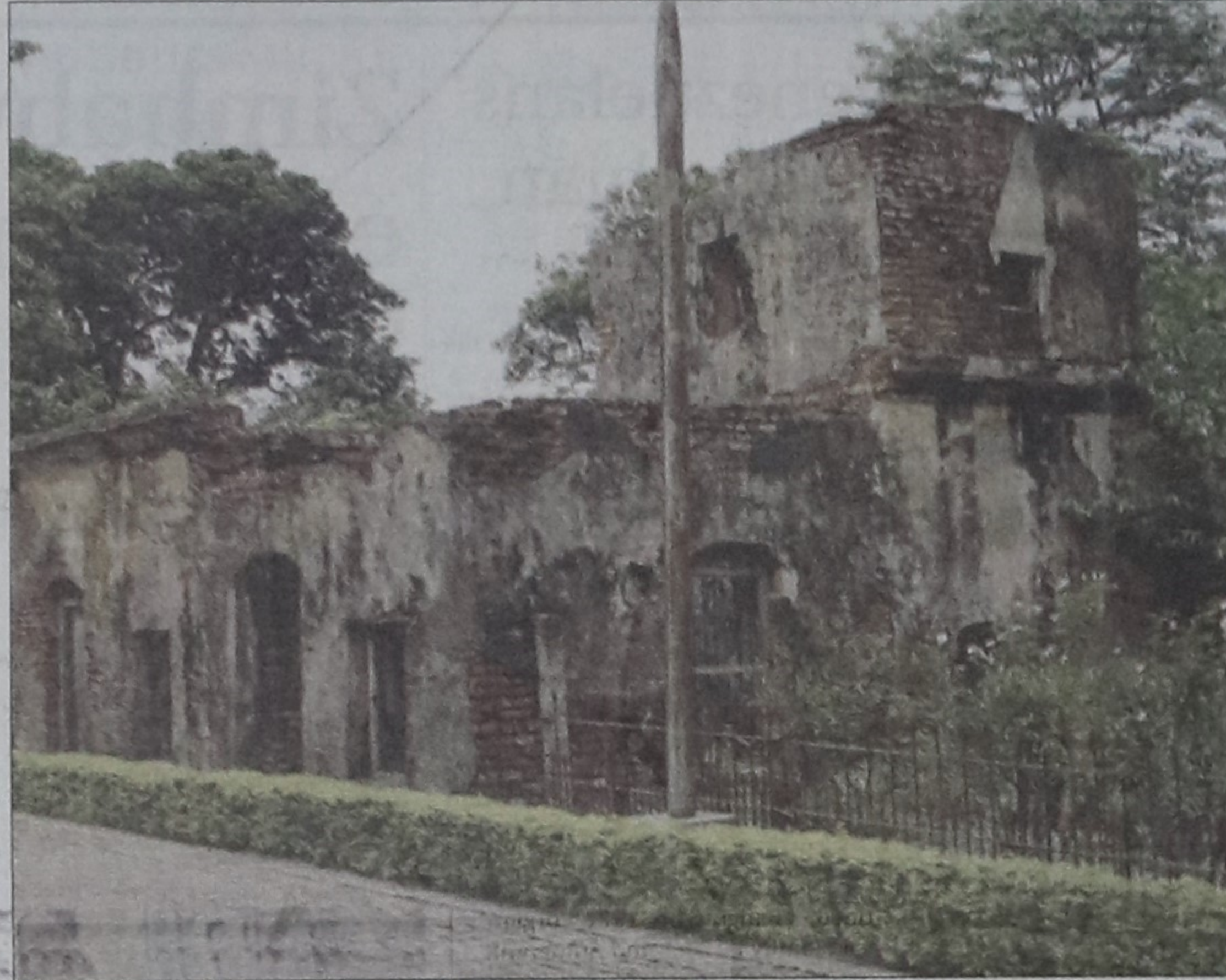
The dilapidated Kachharibari in Shahzadpur.

Sources at the local department of archaeology said that, they are facing shortage of funds and manpower.