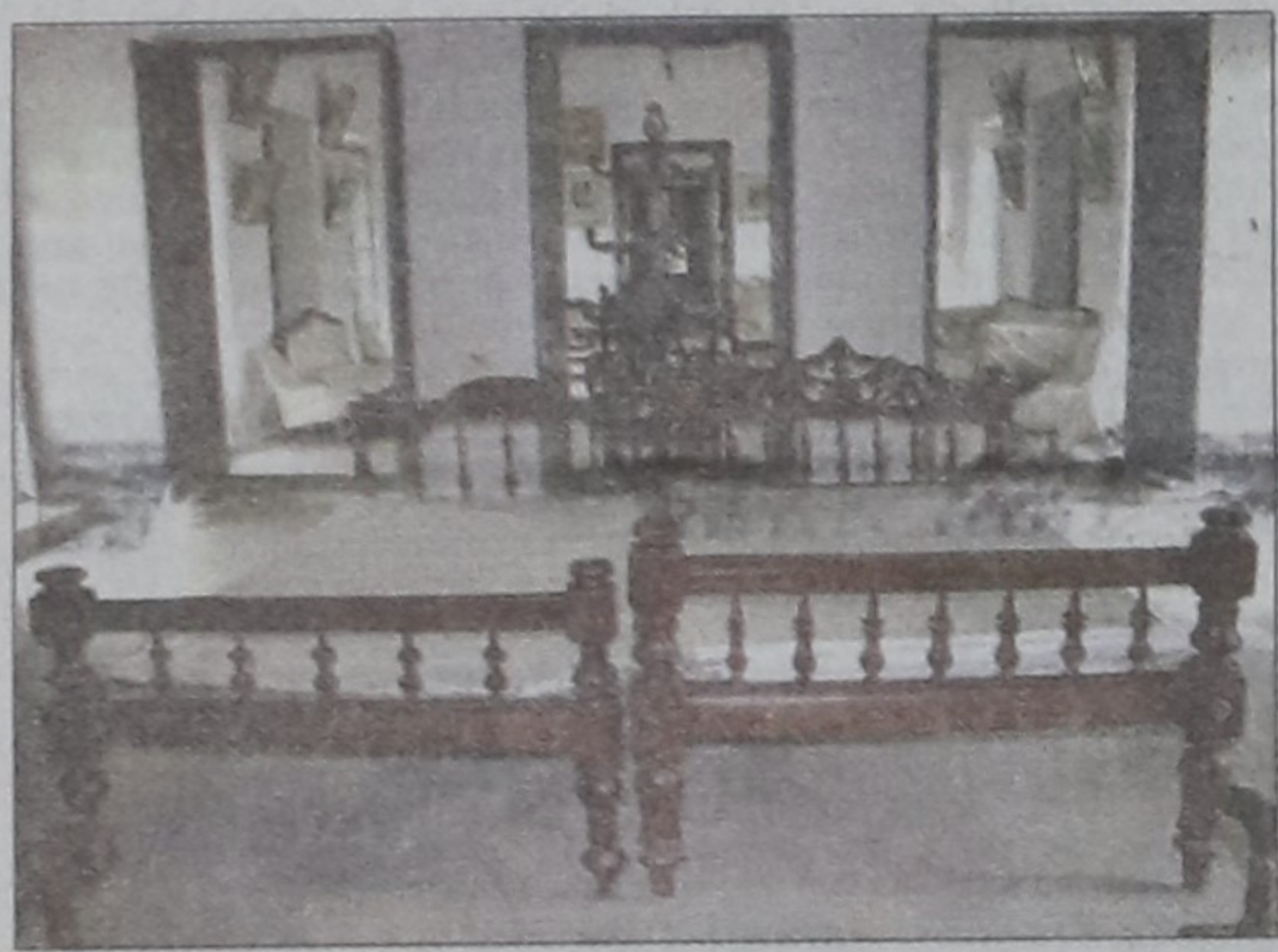
Furniture and other memorabilia at Rabindra Memorial Museum.