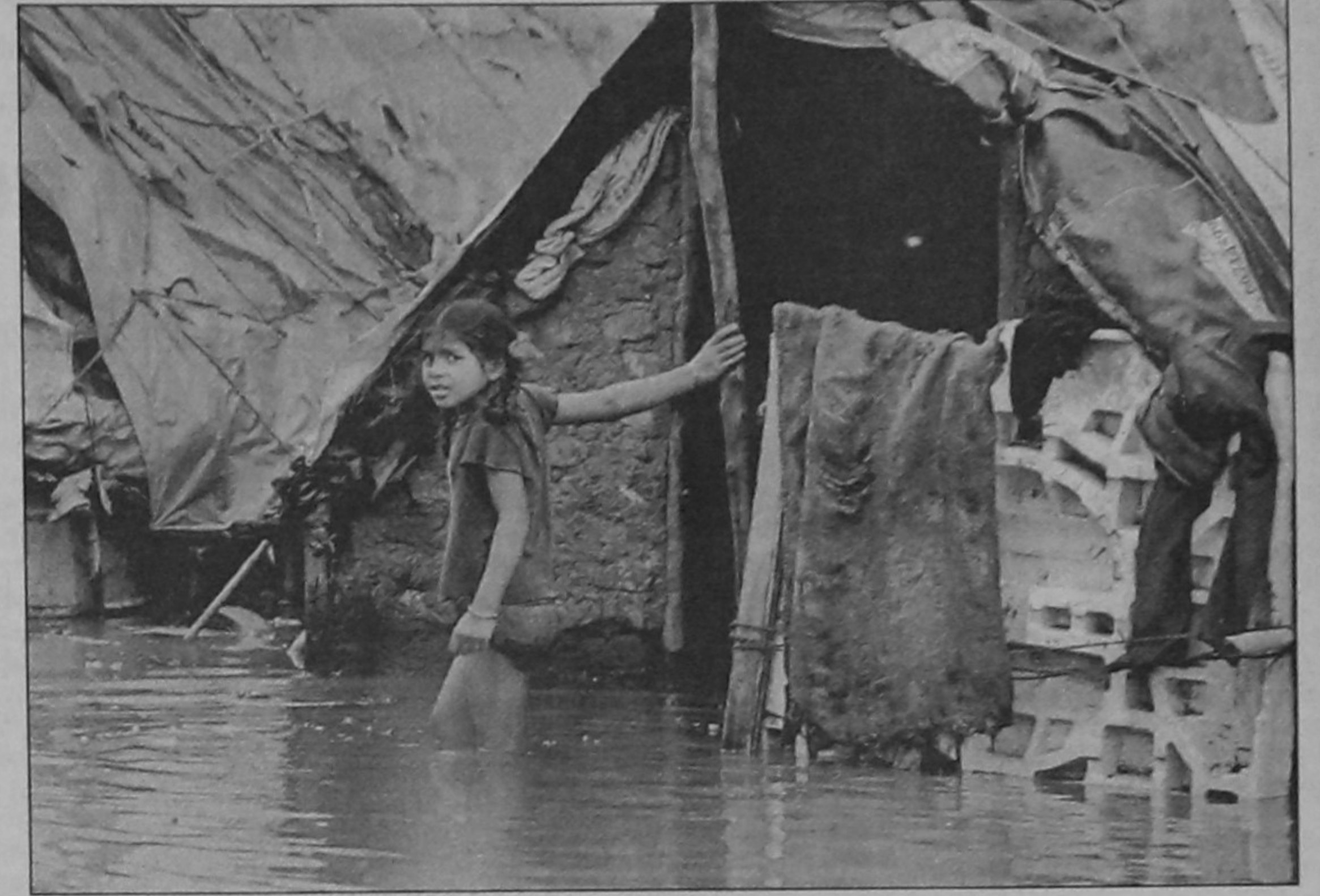
A young Indian girl stands in front of her home, which has been inundated by floodwaters on the outskirts of Hyderabad yesterday. Heavy rains have damaged in some 13 districts of the southern state of Andhra Pradesh, whose officials have appealed to the National Calamity Contingency Fund (NCCF) for assistance in the restoration of essential services.