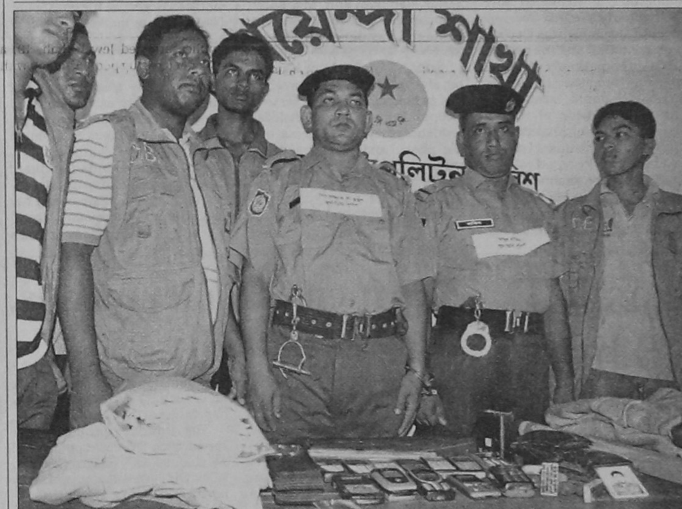
Detective Branch of Police arrested two fake policemen with 12 cellphones in Chittagong city yesterday.