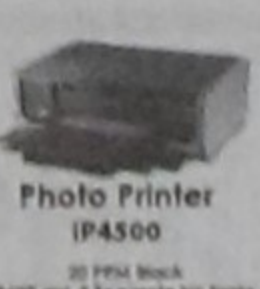
Photo Printer IP4300