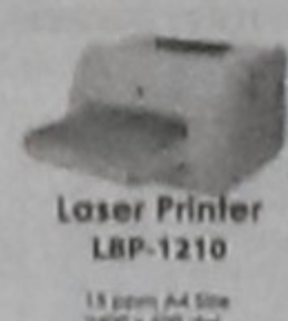
Laser Printer LBP-1210