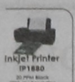
Inkjet Printer IP1880

13/1 Fatema Arcade (2nd floor), Road No. 5, Dhanmondi R/A, Dhaka-1205 Tel: 9664101, 9662001, 9611444 Fax: 845-2-4610410 E-mail: jan-mkt@global-bd.net