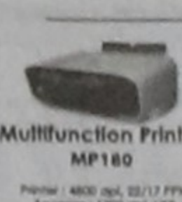
Multifunction Printer MP180