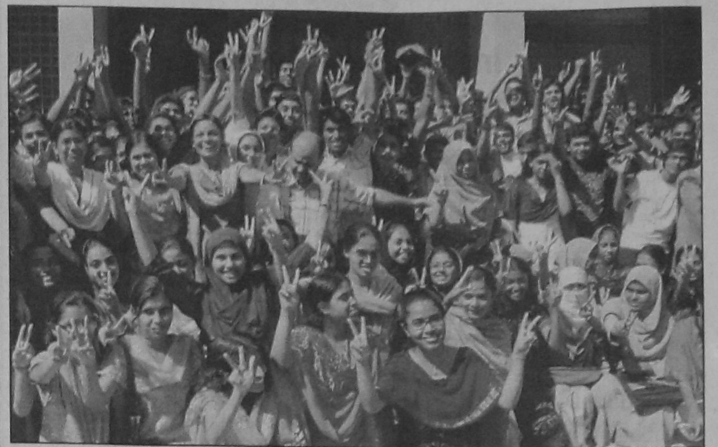
JOY OF SUCCESS: Jubilant GPA-5 achievers of Rajshahi New Government Degree College flash V-sign after publication of HSC results yesterday.