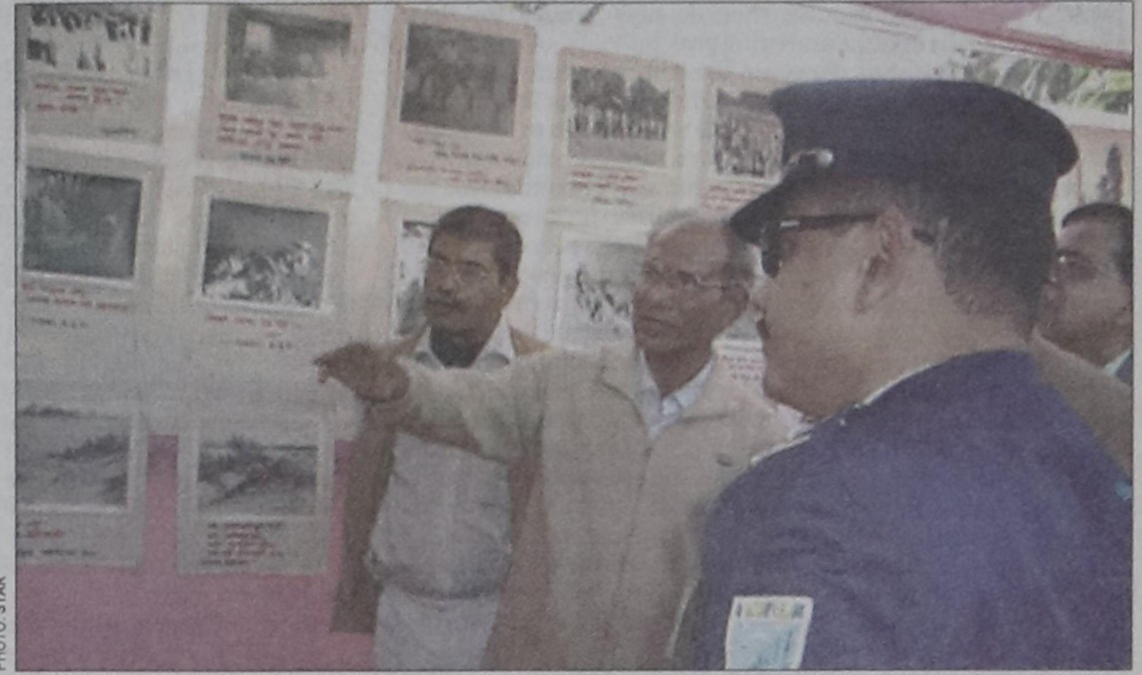
Visitors at a photo exhibition organised by Ashis (top). A photo taken during the Liberation War preserved at the Ashis Library.

Ashis regularly organises photography exhibitions featuring contemporary and rare collections along with competitions marking various national days such as Victory Day, Independence Day, World Photography Day, International Mother Language Day and Pahela Baishakh . Ashis has so far organised 15 photography exhibitions and competitions including three at national level. "Open Photography Exhibition" (in 1978), "Portrait and Nature" (in 1978), "Children of Bangladesh" (in 1979) -- national level programme supported by