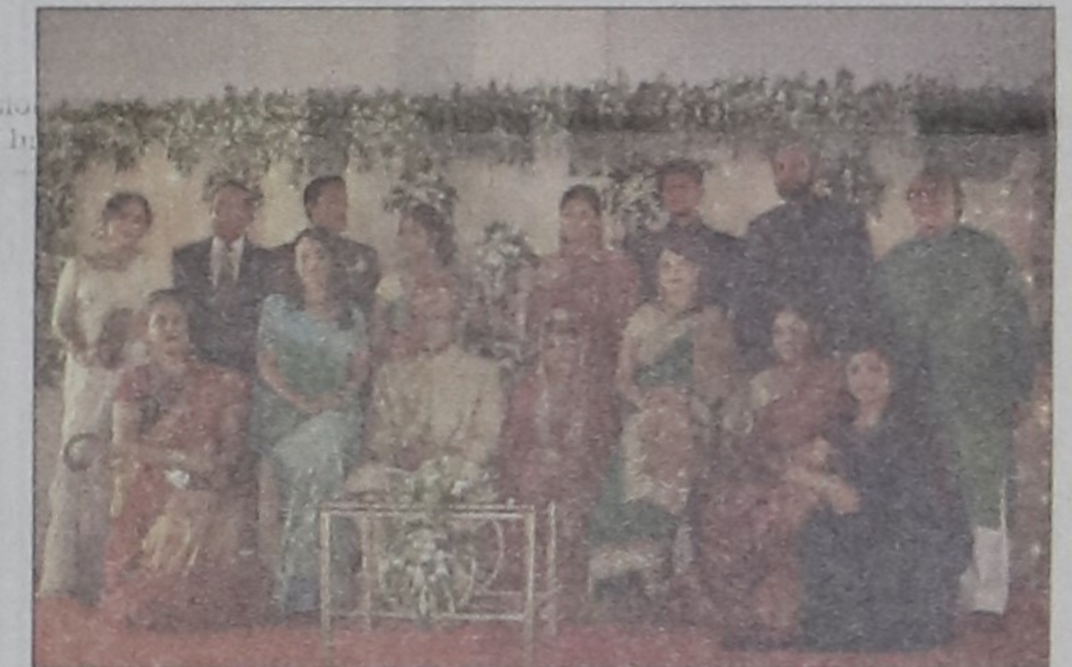
The cast of Gulshan Avenue .