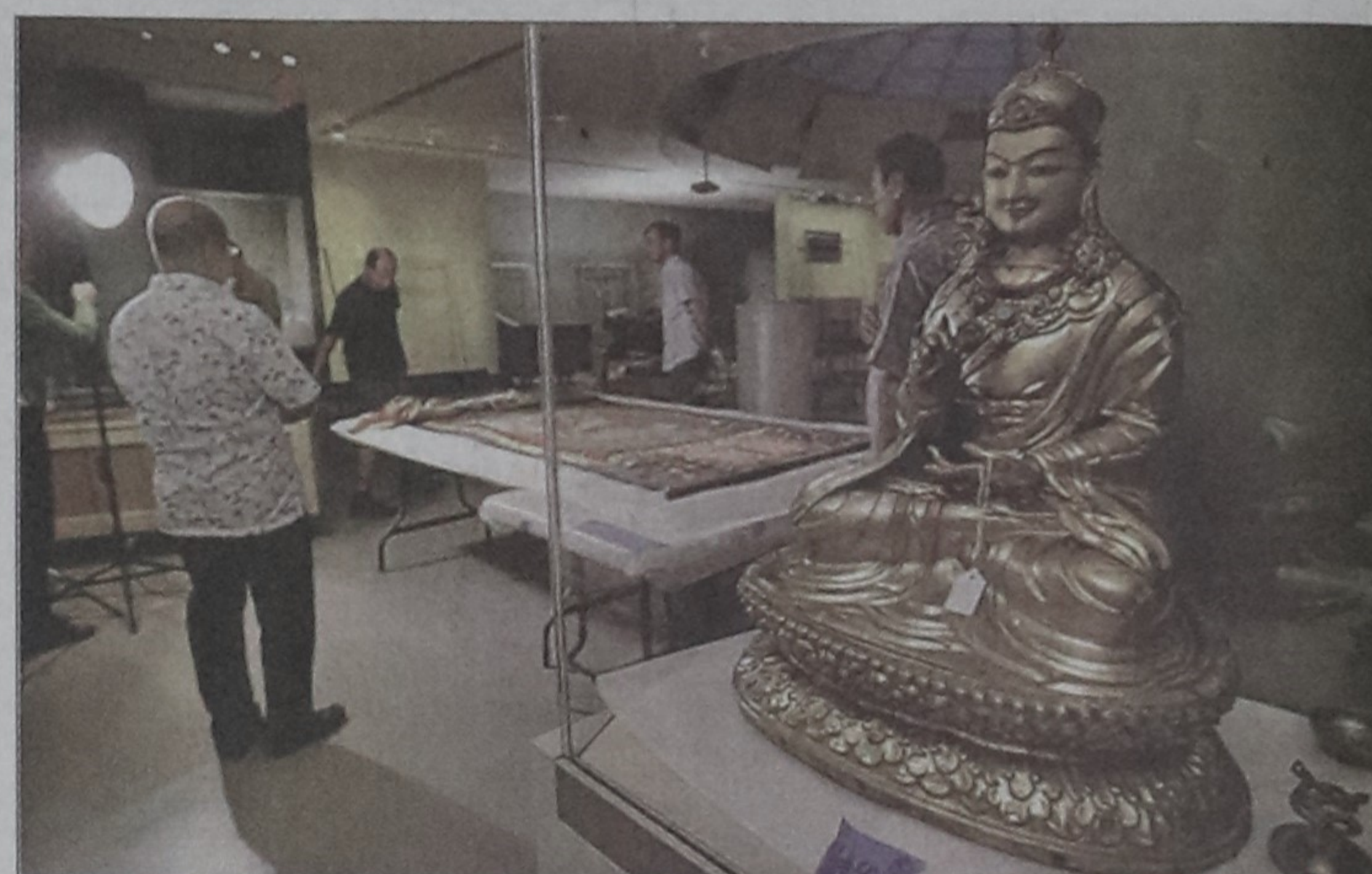
An ancient bronze sculpture inlaid with gold and turquoise, one of the 87 featured objects at the "The Dragon's Gift" exhibition.