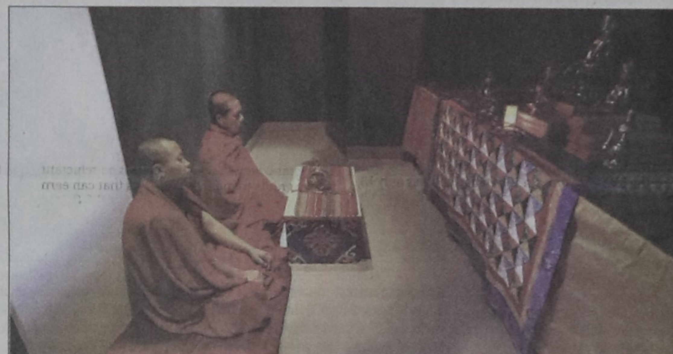
The monks praying at the temporary shrine at the Rubin Museum.