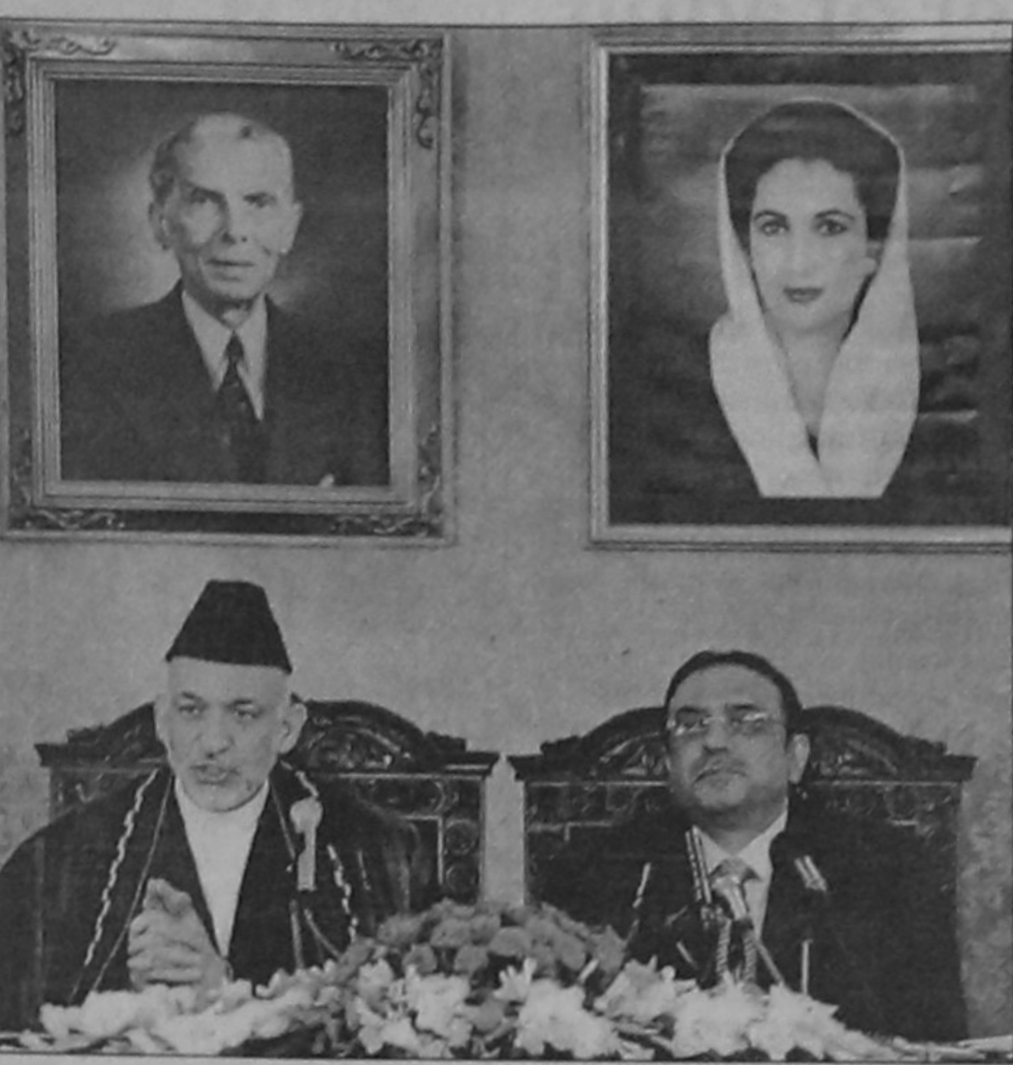
Pakistan's new President Asif Ali Zardari (R) together with his Afghan counterpart Hamid Karzai address a joint press conference at the Presidential Palace in Islamabad yesterday.

Meanwhile, Pakistani troops backed by tanks yesterday killed at least seven Taliban militants in a restive tribal area bordering Afghanistan, officials said.