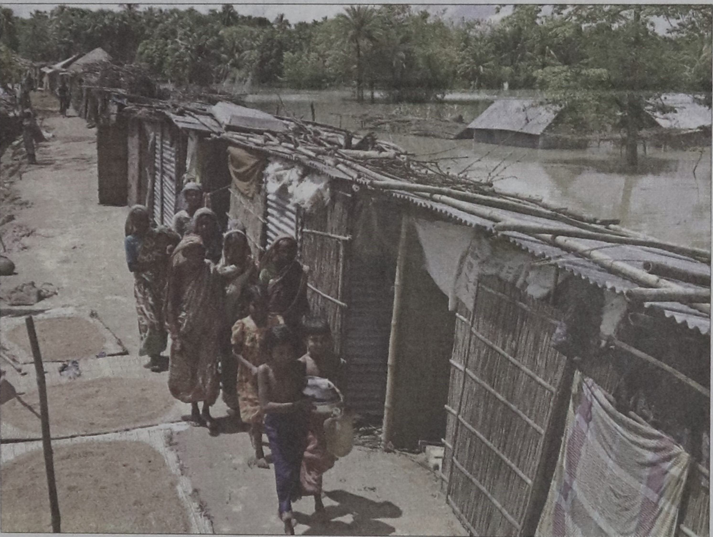
Around 1,000 flood-affected families take shelter on Faridpur town flood-protection embankment at Sadipur as flooding in the district wiped out their homes. The photo was taken yesterday.