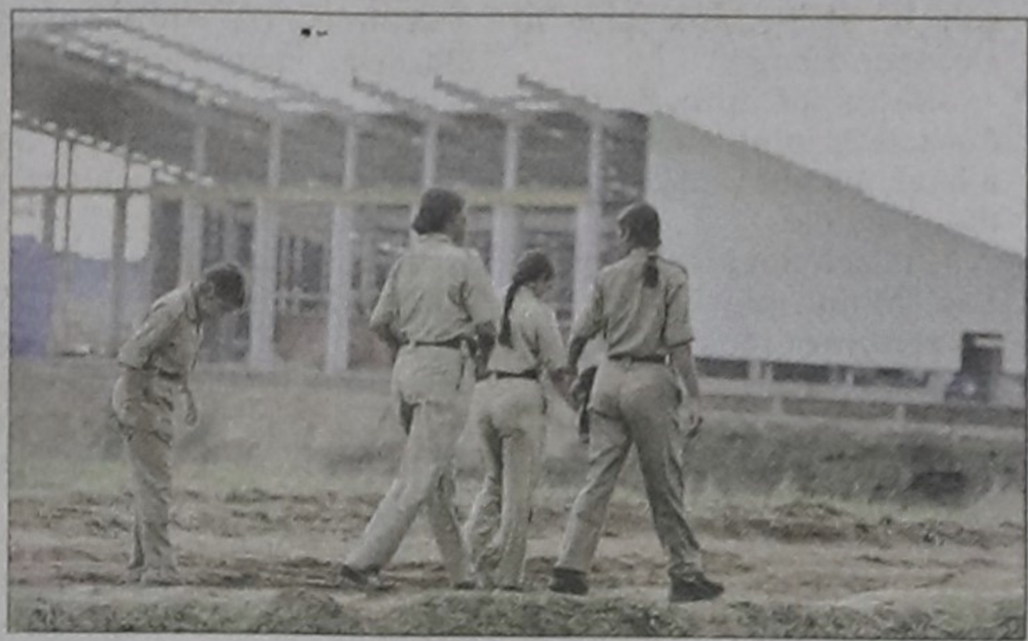
A file photo shows Indian security guards walking past an under-construction section of Tata Motors plant in Singur, Kolkata. A two-year-old agitation by farmers in West Bengal against the Tata Motors factory, set to produce the world's cheapest car, ended Sunday night.