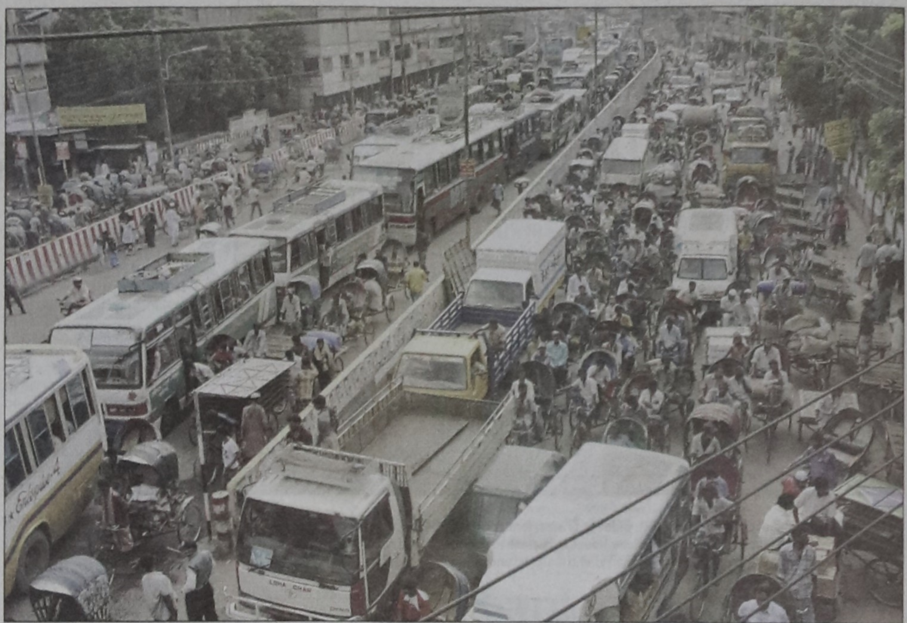
Vehicles stuck in a gridlock on the Second Bangladesh-China Friendship Bridge on the river Buriganga in the city's Nayabazar area yesterday.