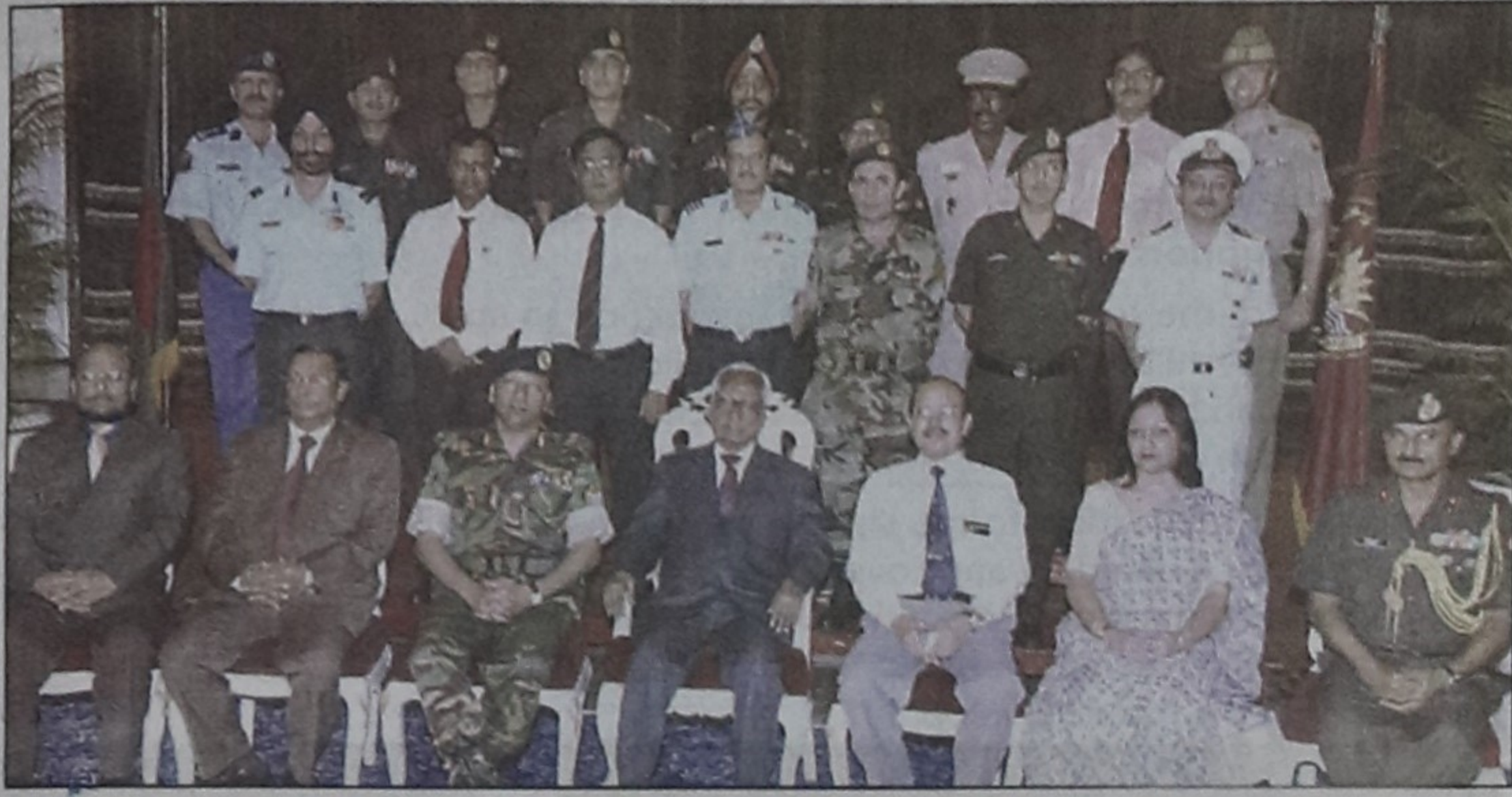
A delegation of National Defence College (NDC) of India poses for photograph with President Iajuddin Ahmed at Bangabhaban in the city yesterday.

The Indian NDC team arrived here on Sunday on a five-day visit.