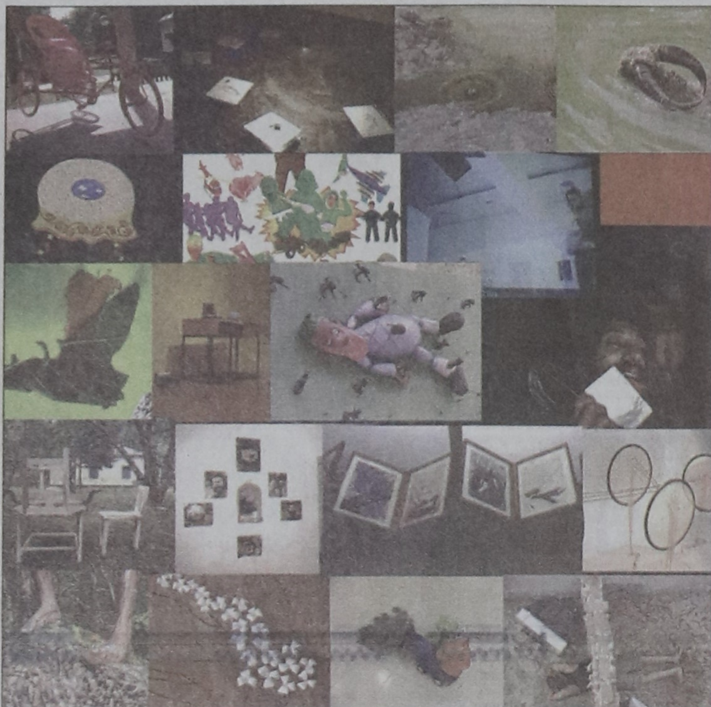
A collage of artworks on display at the exhibition.