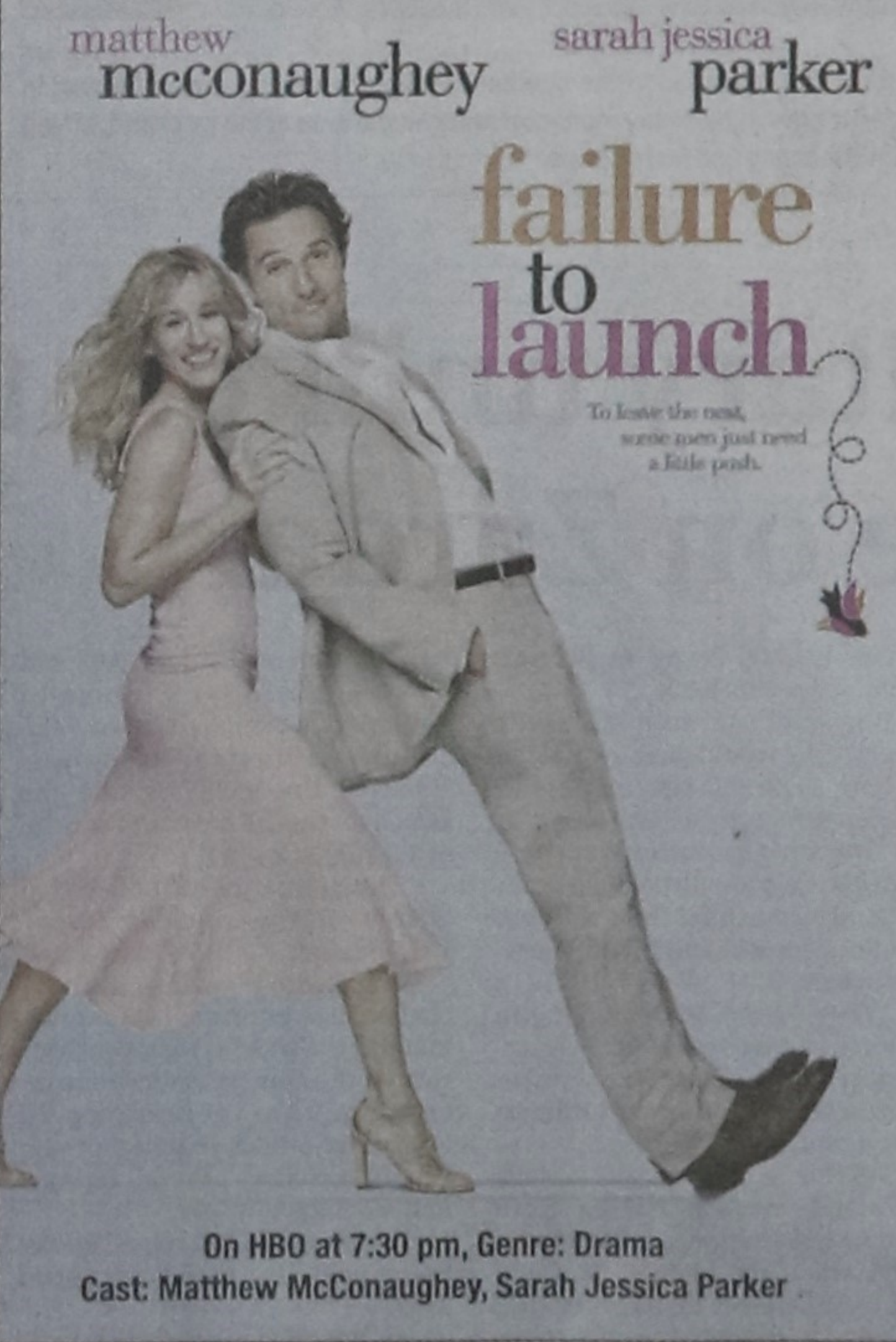
On HBO at 7:30 pm, Genre: Drama Cast: Matthew McConaughey, Sarah Jessica Parker

05:25 Hridoye Raanjaan 06:15 Apnar Jigyahsa 08:15 Drama Serial: Eit Khather Khancha 09:00 Music Express 09:45 Drama Serial: Baishakh Theke Srabon 11:30 Talk Show: Ei Shomoy