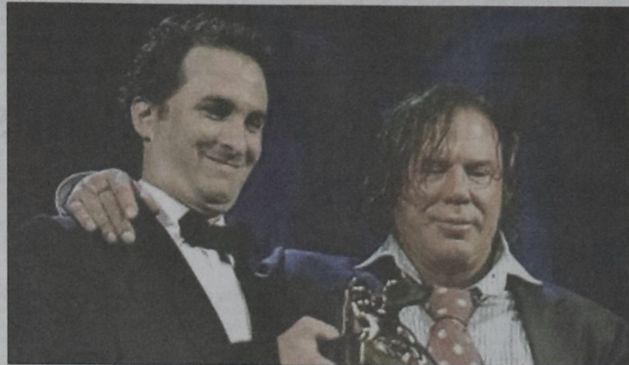
Darren Aronofsky (left) and Mickey Rourke with the Golden Lion.

The Silver Lion for best director went to Russia's Aleksei German Jr. for "Paper Soldier," a recreation of the Soviet effort to put the first man in space in 1961 -- Yuri Gagarin --