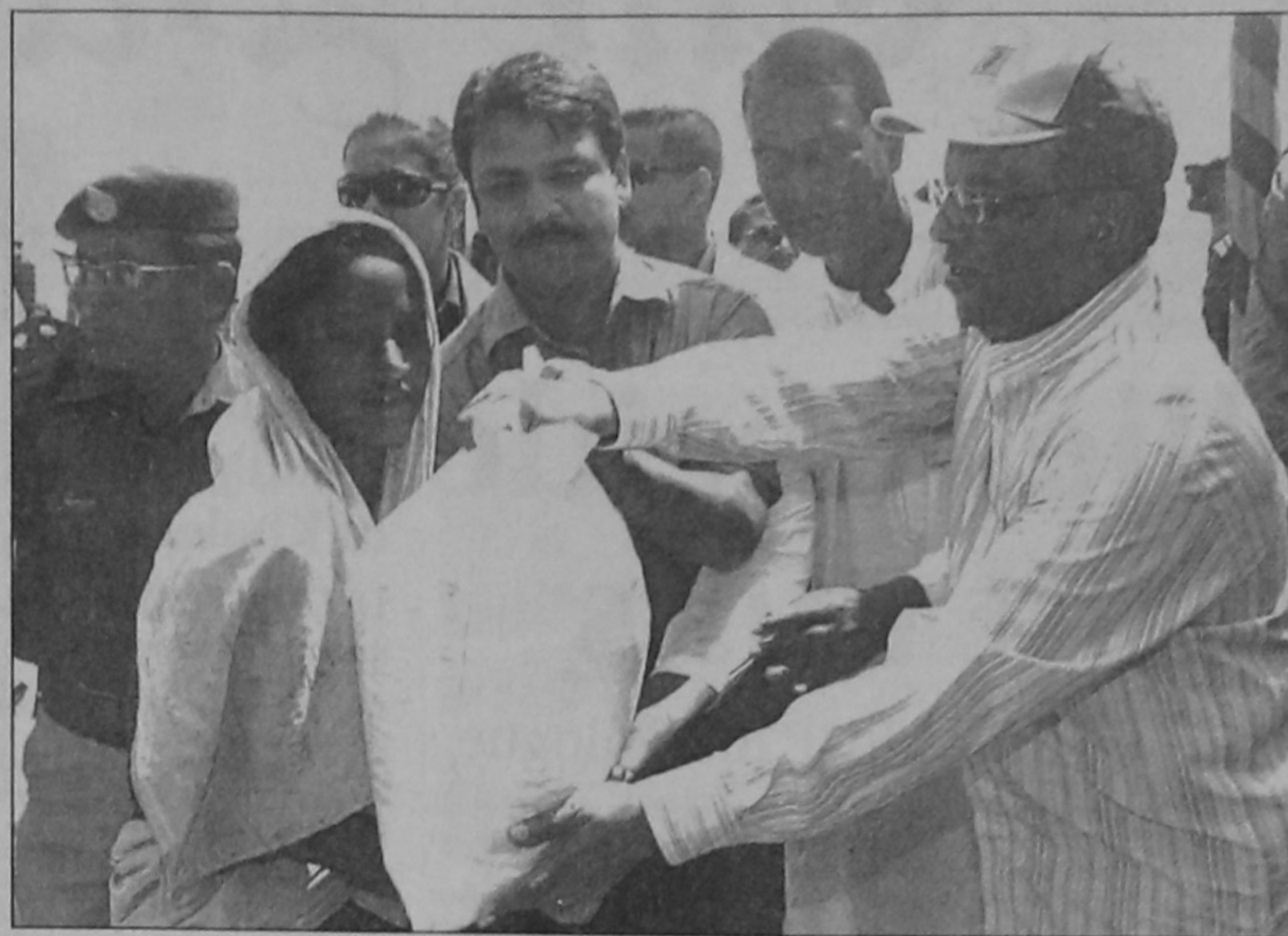
Chief Adviser Fakhruddin Ahmed distributes relief among the flood-affected people at Chandanbaisha union under Sariakandi upazila in Bogra and Khokshabari union under Sadar upazila in Sirajganj yesterday. (Story on Page 1)

On the occasion, a discussion will be held at 4:00pm at Taxes Bar Association auditorium in the city.