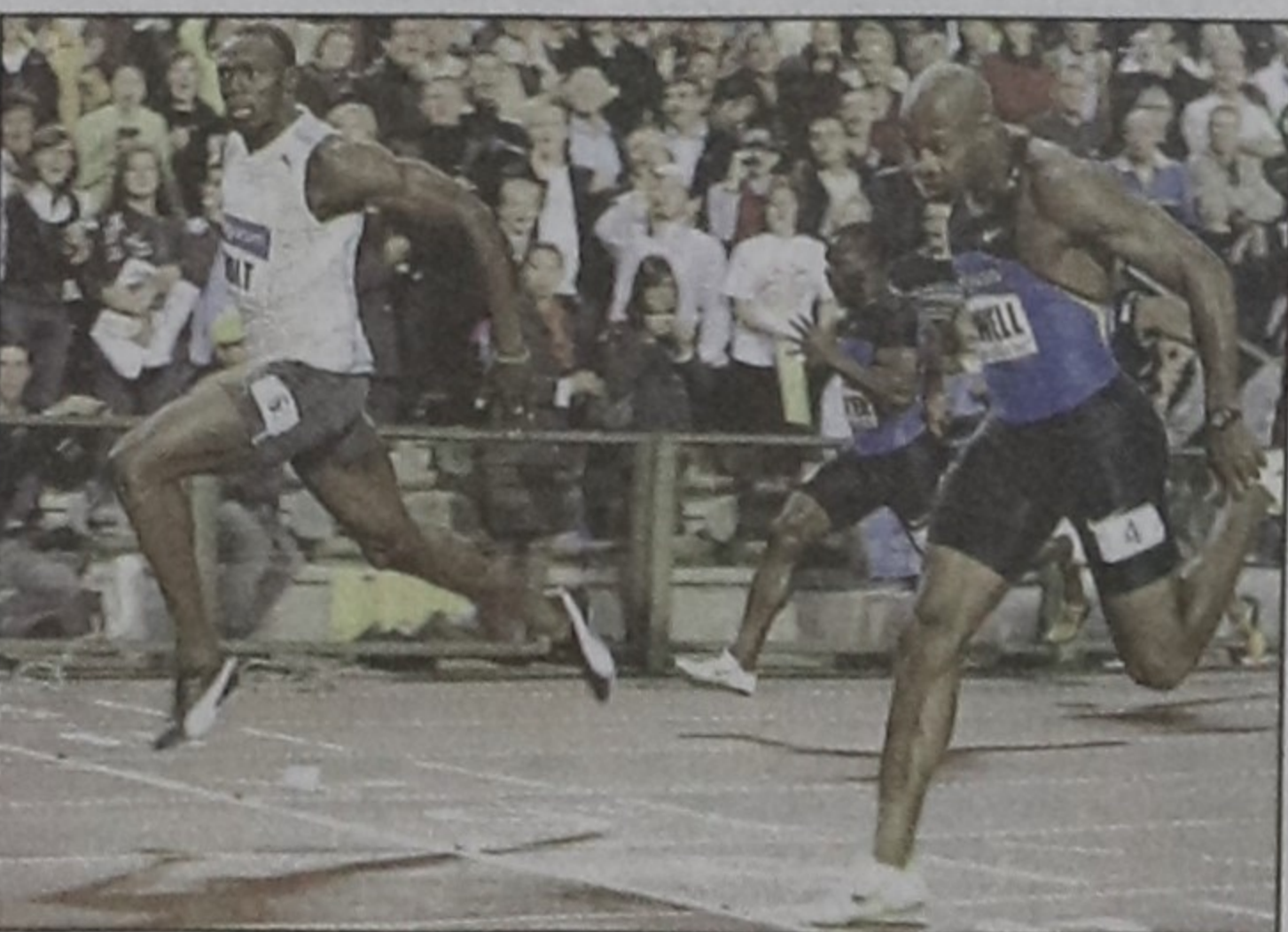
Jamaica's Usain Bolt (L) finishes ahead of compatriot Asafa Powell (R) in the men's 100m at the Golden League in Brussels on Friday.

Jelimo became the first ever Kenyan woman to win a track and field Olympic gold when she clinched the 800m final in Beijing in a world junior record of 1min 54.87secs on August 18.