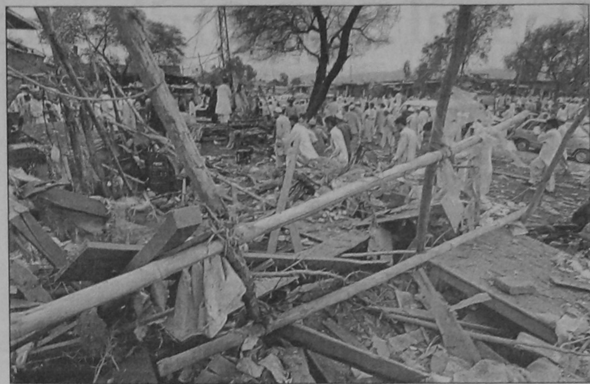
Pakistani residents try to remove debris as they search for suicide attack victims at the attack site in Peshawar yesterday. At least 17 people were killed and about 80 wounded when a suicide car bombing ripped through a security checkpoint outside Pakistan's northwestern city of Peshawar.

The interior ministry last month announced that it was banning the main militant group behind the violence, Tehreek-e-Taliban Pakistan, which has threatened more suicide attacks.