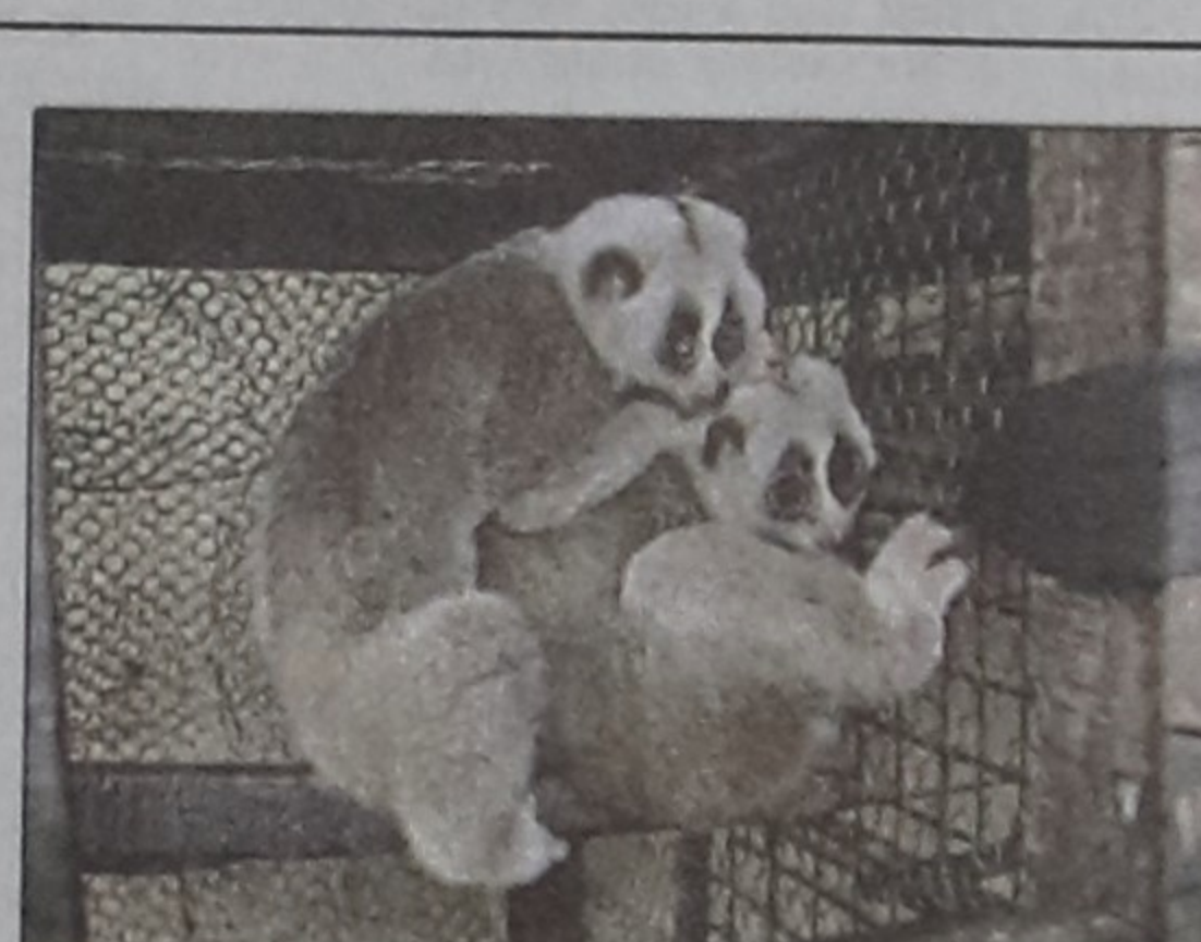
3 Slow lori