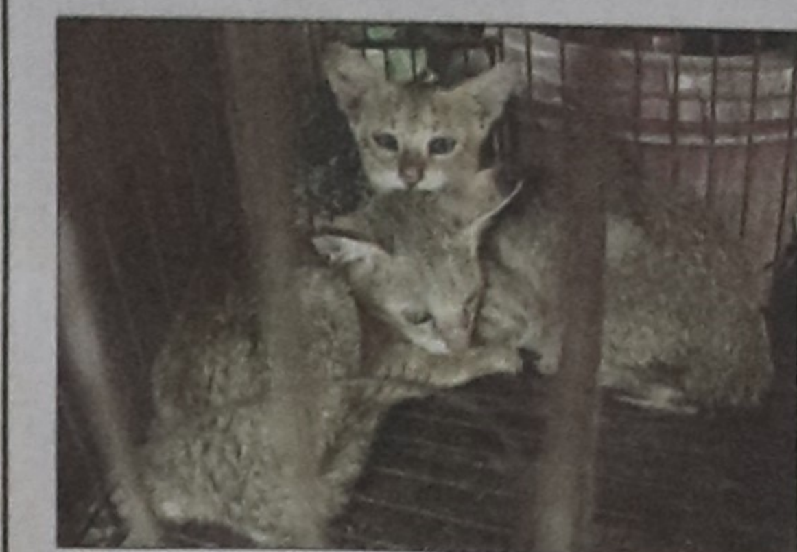
1 Jungle cat