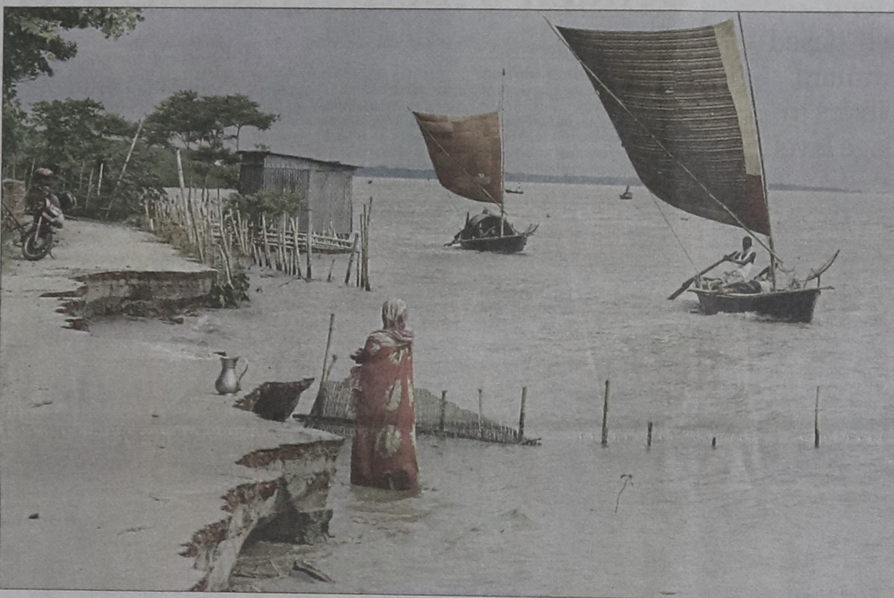
A woman stands near the broken part of a Padma embankment in Bhagyakul union of Srinagar upazila in Munshiganj yesterday. The swelling river has washed away a portion of the embankment.