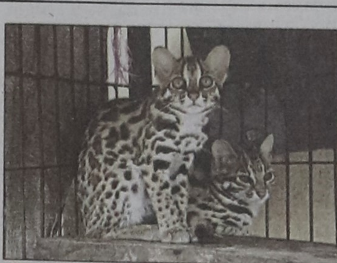
2 Leopard cat