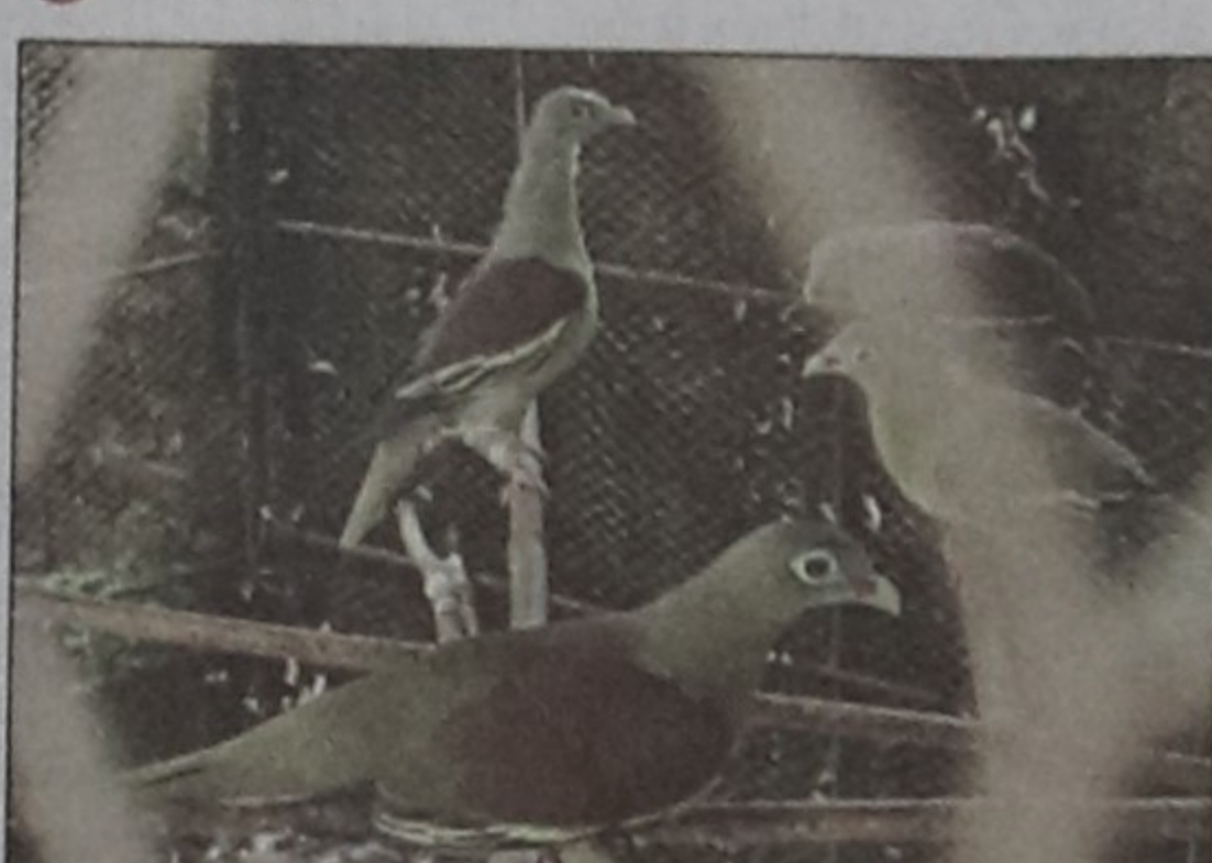
7 Green pigeon