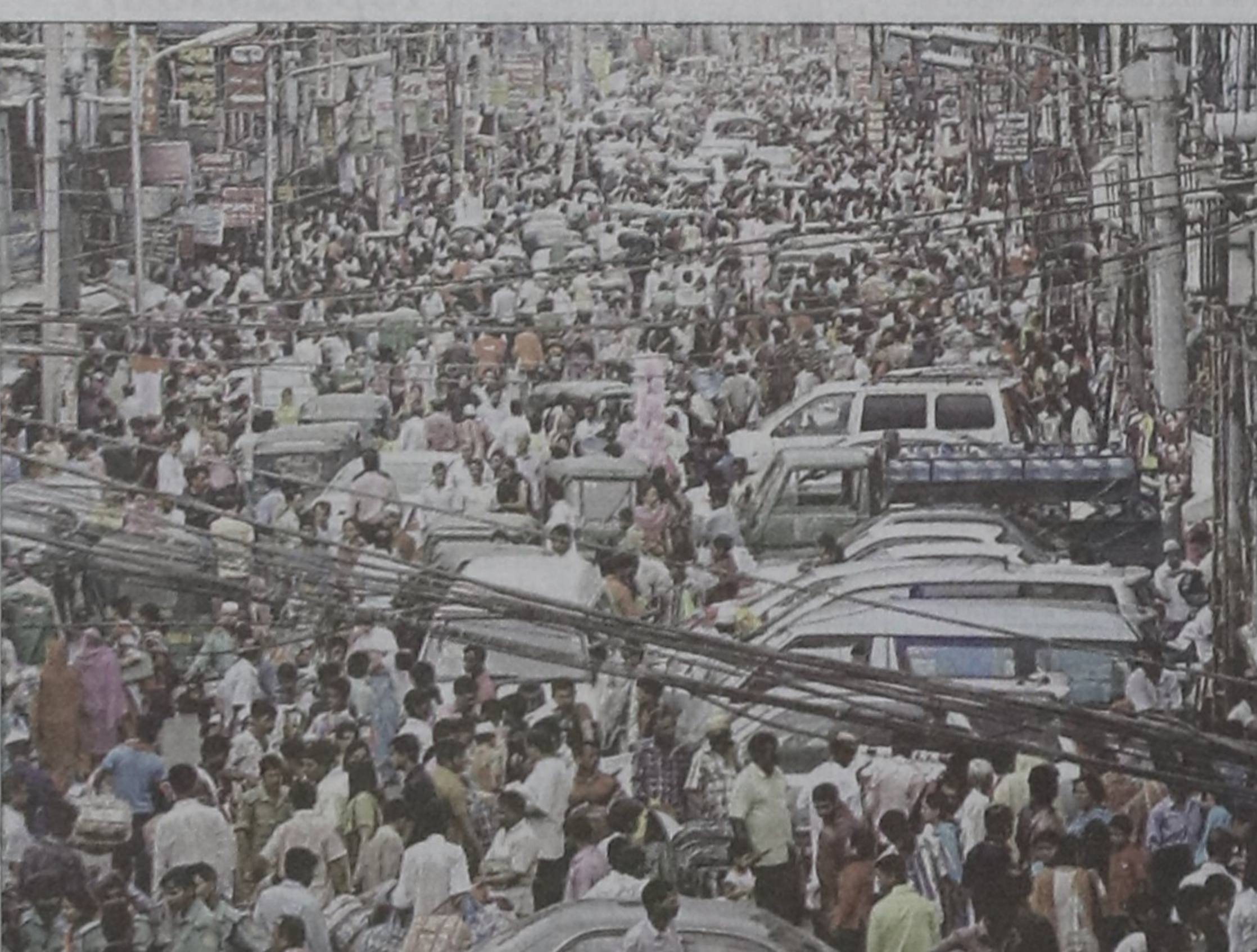
Eid shoppers crowd Gausia Market area yesterday, the first weekend in Ramadan. City dwellers start early shopping as it gets difficult for them to visit the popular malls while the items become pricey days ahead of Eid.