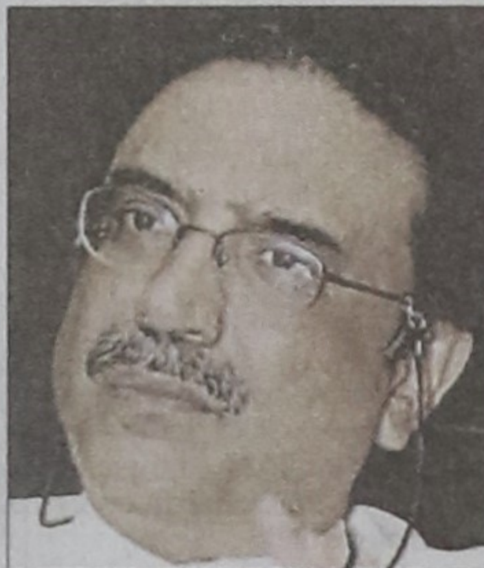
Asif Ali Zardari

Zardari will face a multitude of problems if he wins a secret ballot among lawmakers and takes charge of a nuclear-armed state