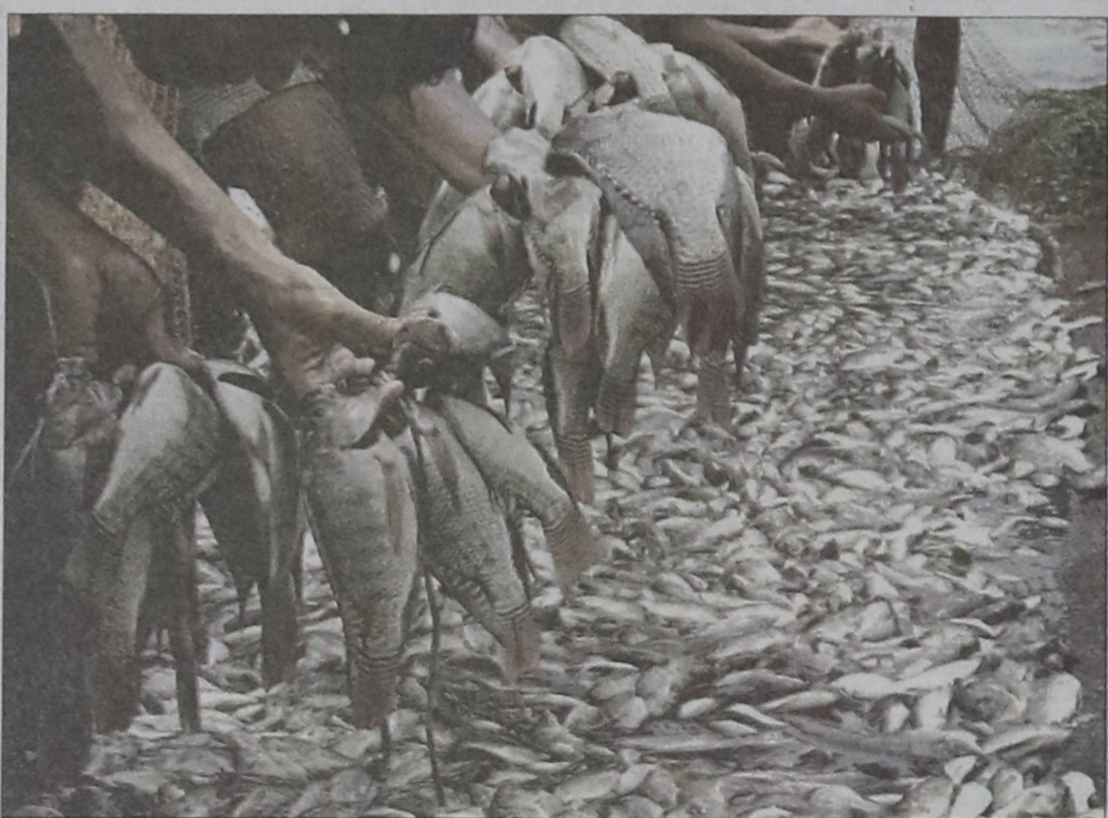
Dhaka Wasa last week poisoned deadly fish in two of its 16 lagoons of the Pagla water treatment plant in Narayanganj. The effort often goes in vain as locals fish in the other lagoons and sell the toxic catch in nearby markets.