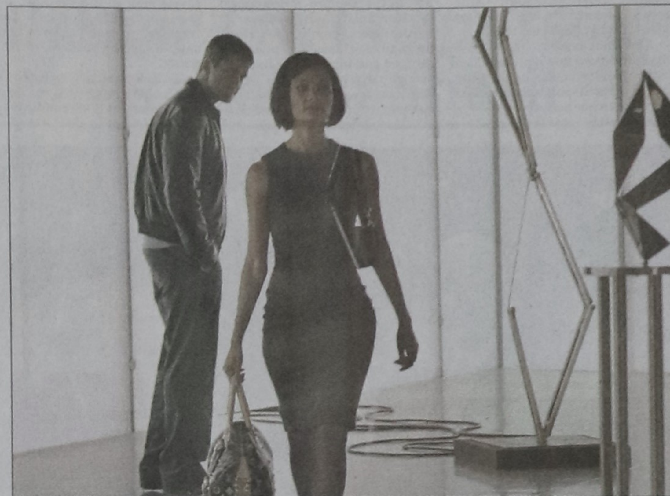
Gerard Butler and Thandie Newton in RocknRolla , one of the most anticipated films at the festival.

"This film took an uncommonly long time to get around to making, and hundreds of people