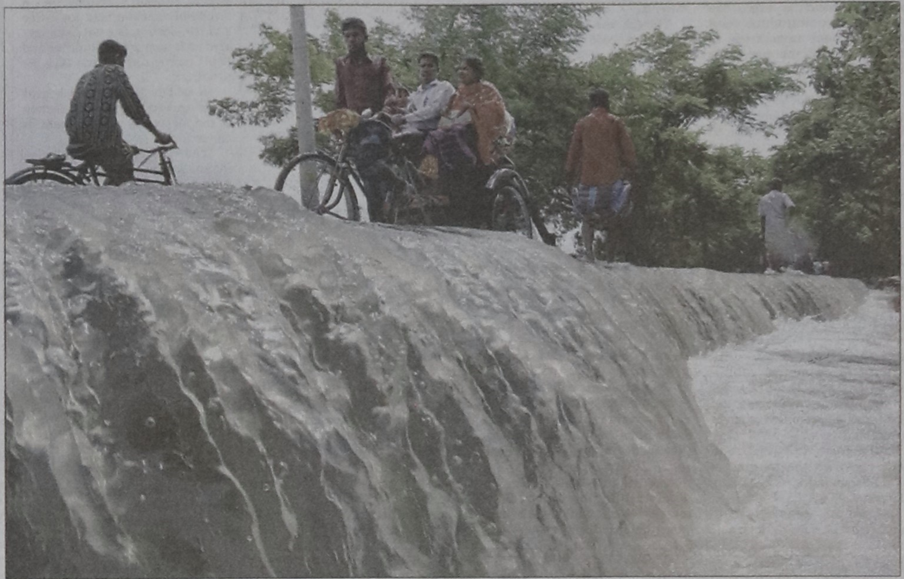
The Padma flows over a road near Balasur intersection at Srinagar in Munshiganj yesterday as the river water crossed the danger level there.

Suranjit said they would seek a consensus with the EC at the talks on September 9. But if the commission refuses to change its plan, his party would resort to street agitation to press home its demand for national election first.