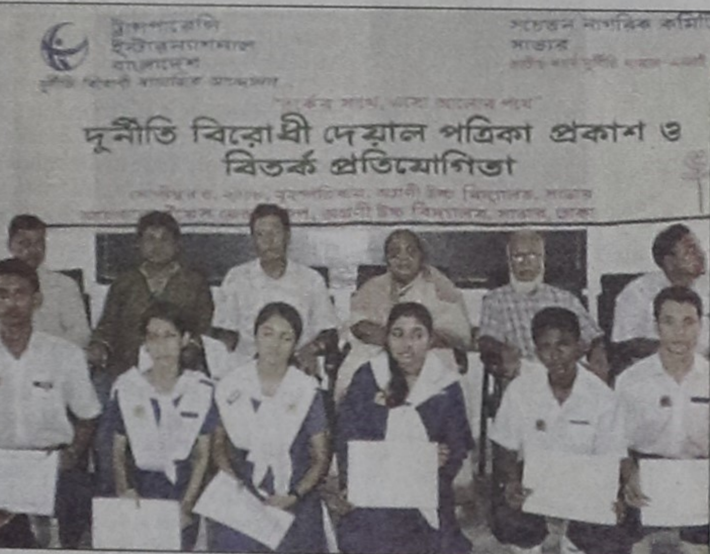
Winners of an anti-corruption debate competition pose for photograph with the guests at Savar Agrani High School yesterday. Transparency International Bangladesh (TIB) and Yes Friends Groups of Sachetan Nagarik Committee (Sanac) in Savar jointly organised the competition.

Agrani Yes Friends Group also published a wall magazine and a little magazine titled 'In the ray of light' to bolster the government's anti-corruption drive.