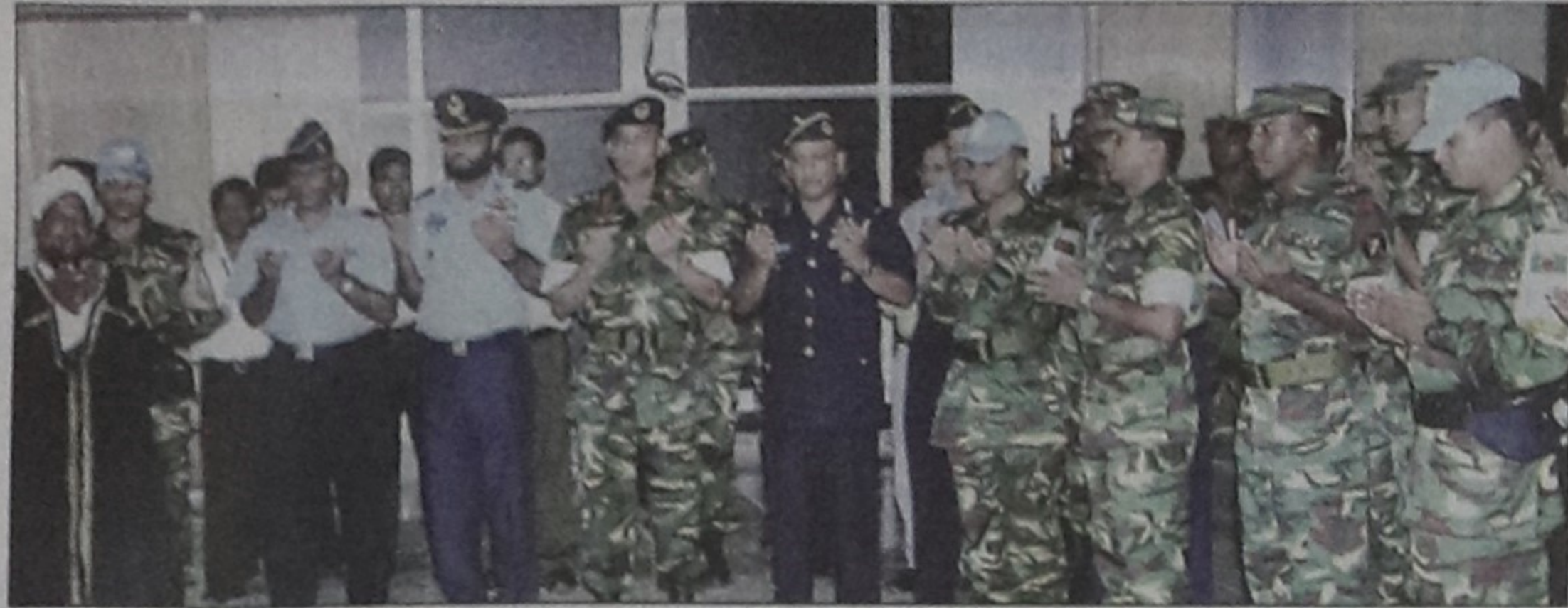
Members of an armed forces contingent of Bangladesh Army offer munajat before boarding a UN Chartered plane on Wednesday night. They will join the UN Peacekeeping Mission in Congo.