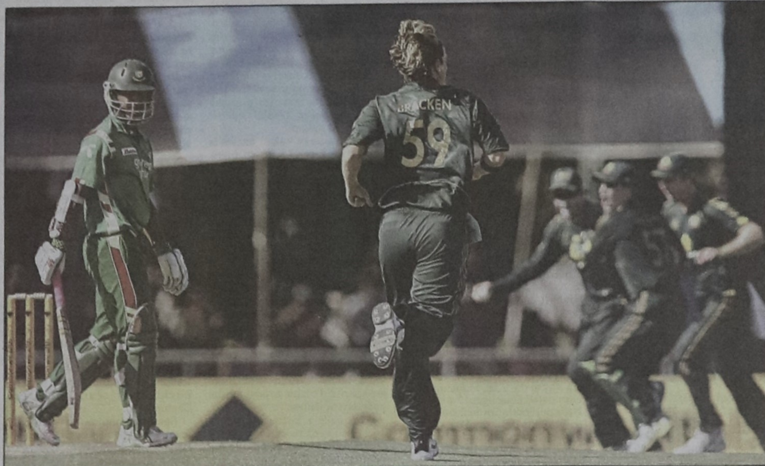
IT HAS HAPPENED AGAIN: Bangladesh opener Tamim Iqbal makes an early exit after edging the first ball of the innings to second slip David Hussey off left-arm Nathan Bracken in the second one-dayer against Australia at the TIO Stadium in Darwin yesterday.