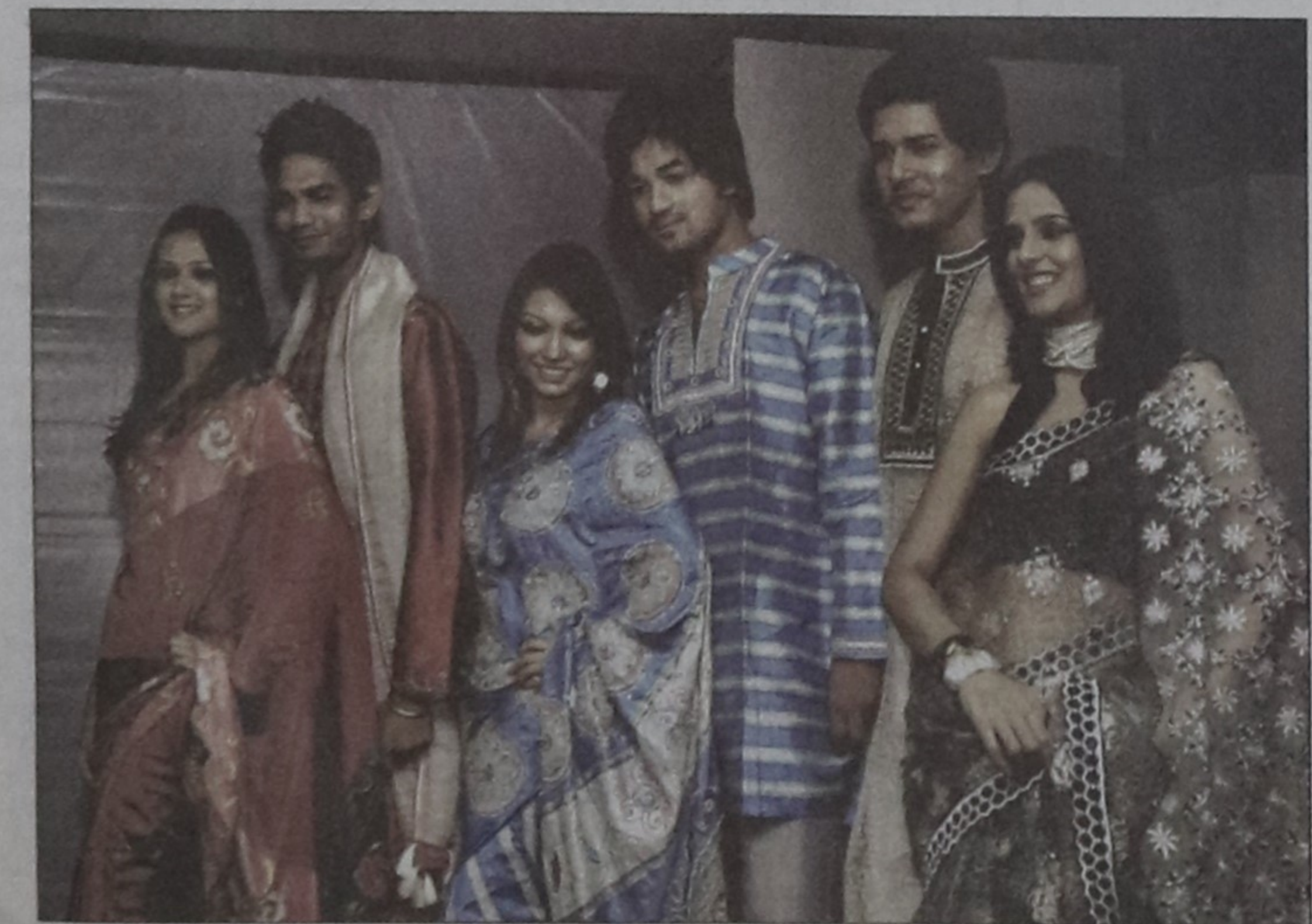
Models display Anjan's Eid collection.

The clothes are available at all outlets of Anjan's spread across Dhaka and Chittagong. Also available is a collection for children, jewellery, shawls and other gift items.