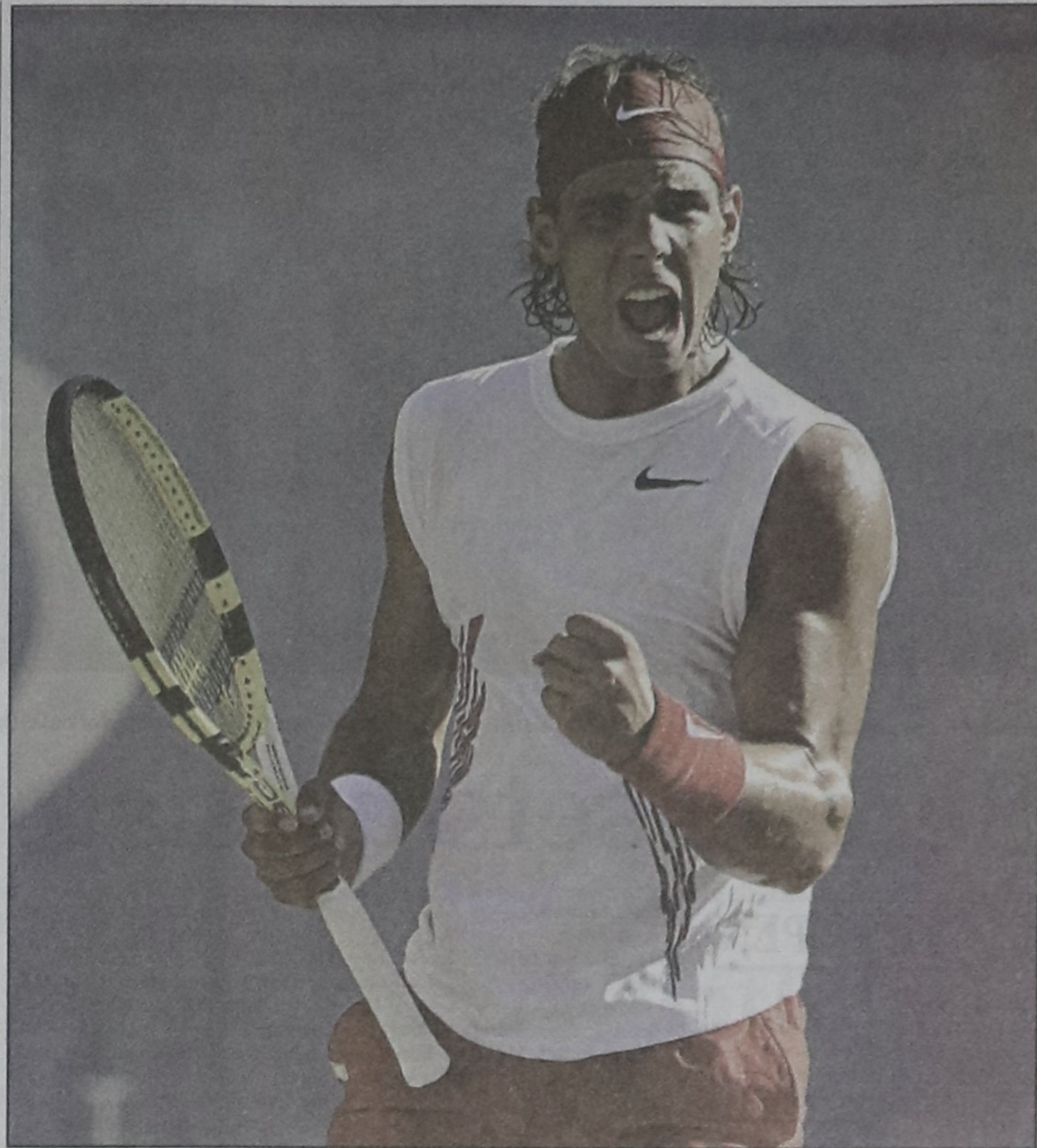
World number one Rafael Nadal of Spain celebrates his win over American Sam Querrey during their US Open fourth round tie at Flushing Meadows on Monday.