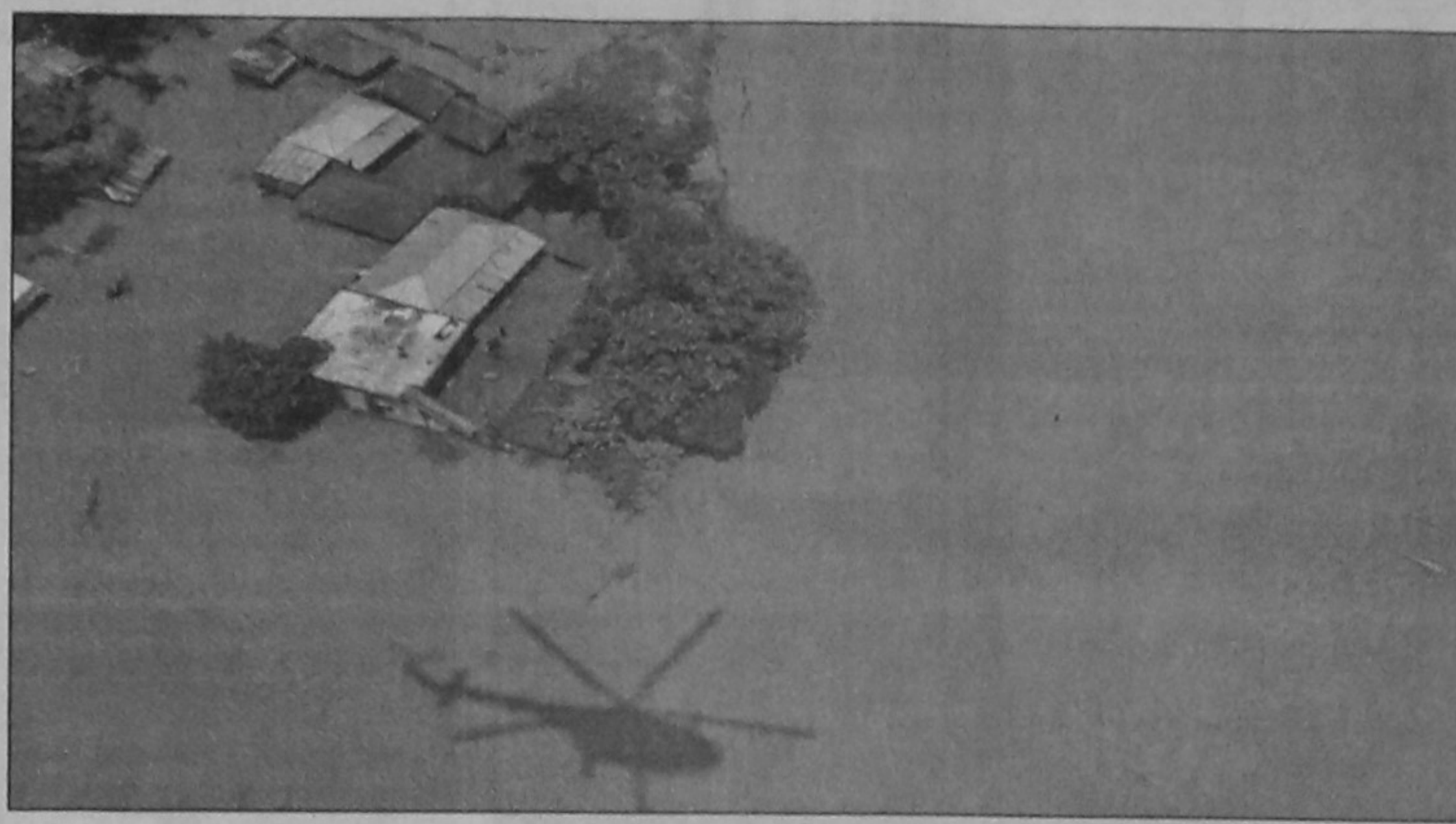
In this aerial view an Indian Air Force (IAF) helicopter casts a shadow over floodwaters near the submerged village of Kumarkhad in Madhubani district, some 320km north-east of Patna yesterday. Hundreds of thousands of flood victims huddled into makeshift camps in India and Nepal face major disease outbreaks if help fails to reach them quickly, aid workers have warned.

To a question, he said a National Assembly member from the Pakistan Muslim League-Nawaz had also contacted him, but not the top PML-N leadership.