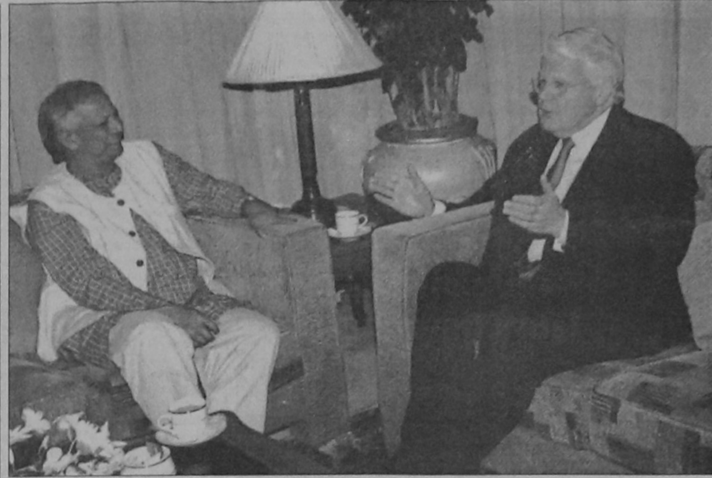
Nobel laureate Prof Muhammad Yunus calls on Iceland President Olafur Ragnar Grimsson at Hotel Sheraton in the city on Sunday.