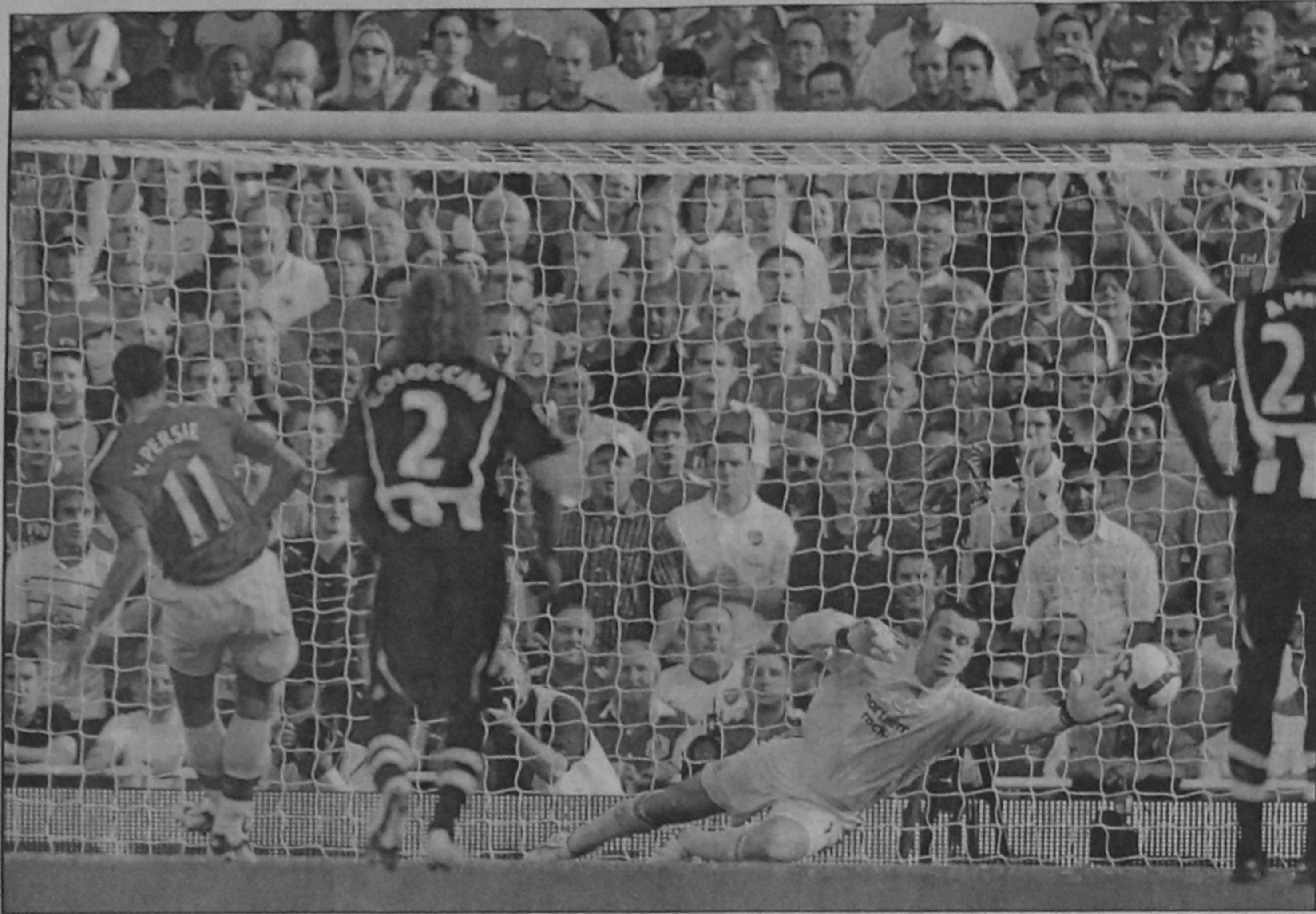
Arsenal striker Robin van Persie (L) scores the opening goal from a penalty against Newcastle during their Premier League encounter at the Emirates Stadium on Saturday.