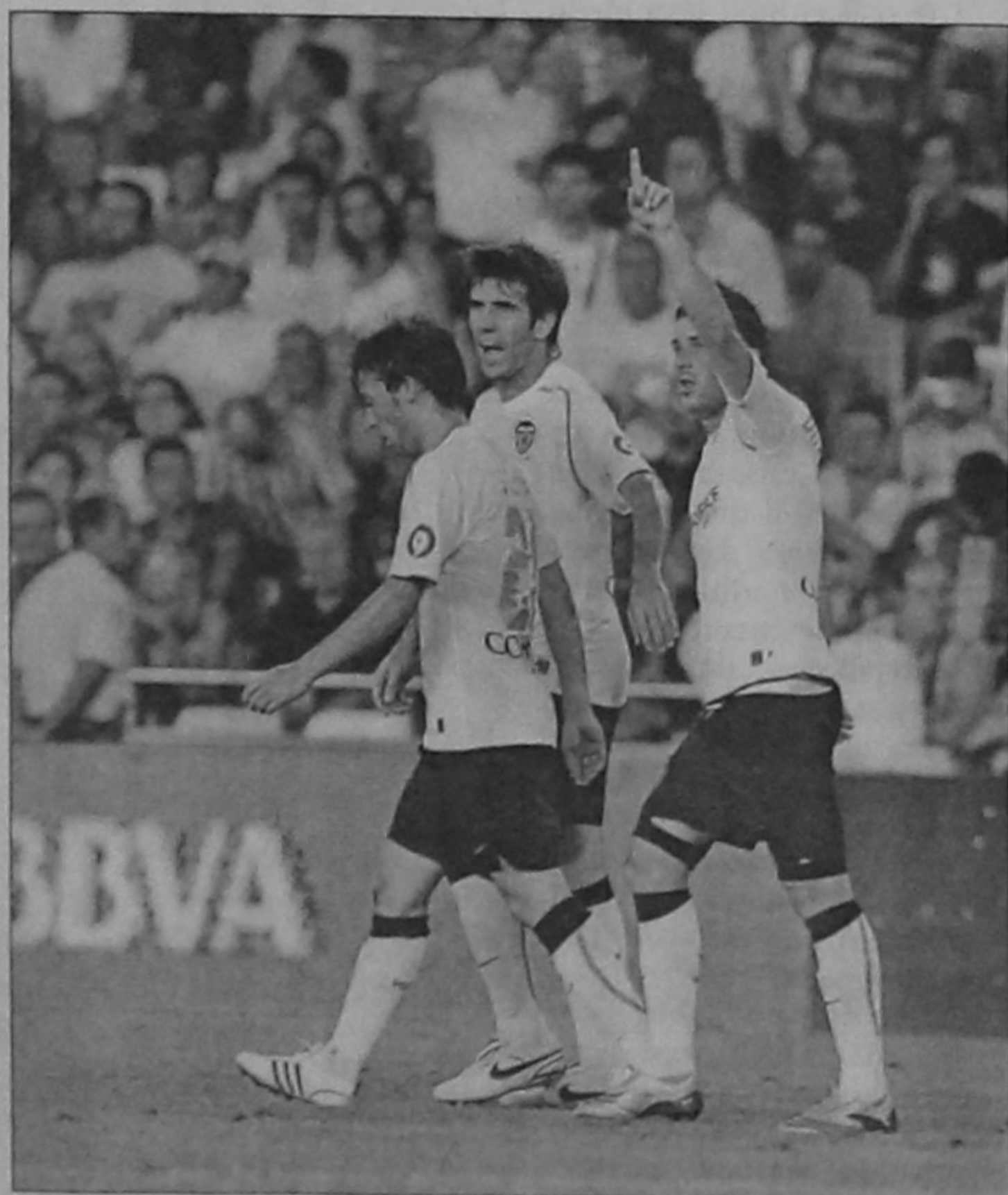
Valencia striker David Villa (R) celebrates his goal with teammates David Albelda (C) and David Silva during their Primera Liga match against Mallorca at the Mestalla on Saturday.

Villa, top scorer at Euro 2008, was the subject of intense interest from Real Madrid in the summer but signed a new deal at Valencia until 2014 and struck on 34 minutes as he continued his purple patch in front of goal.