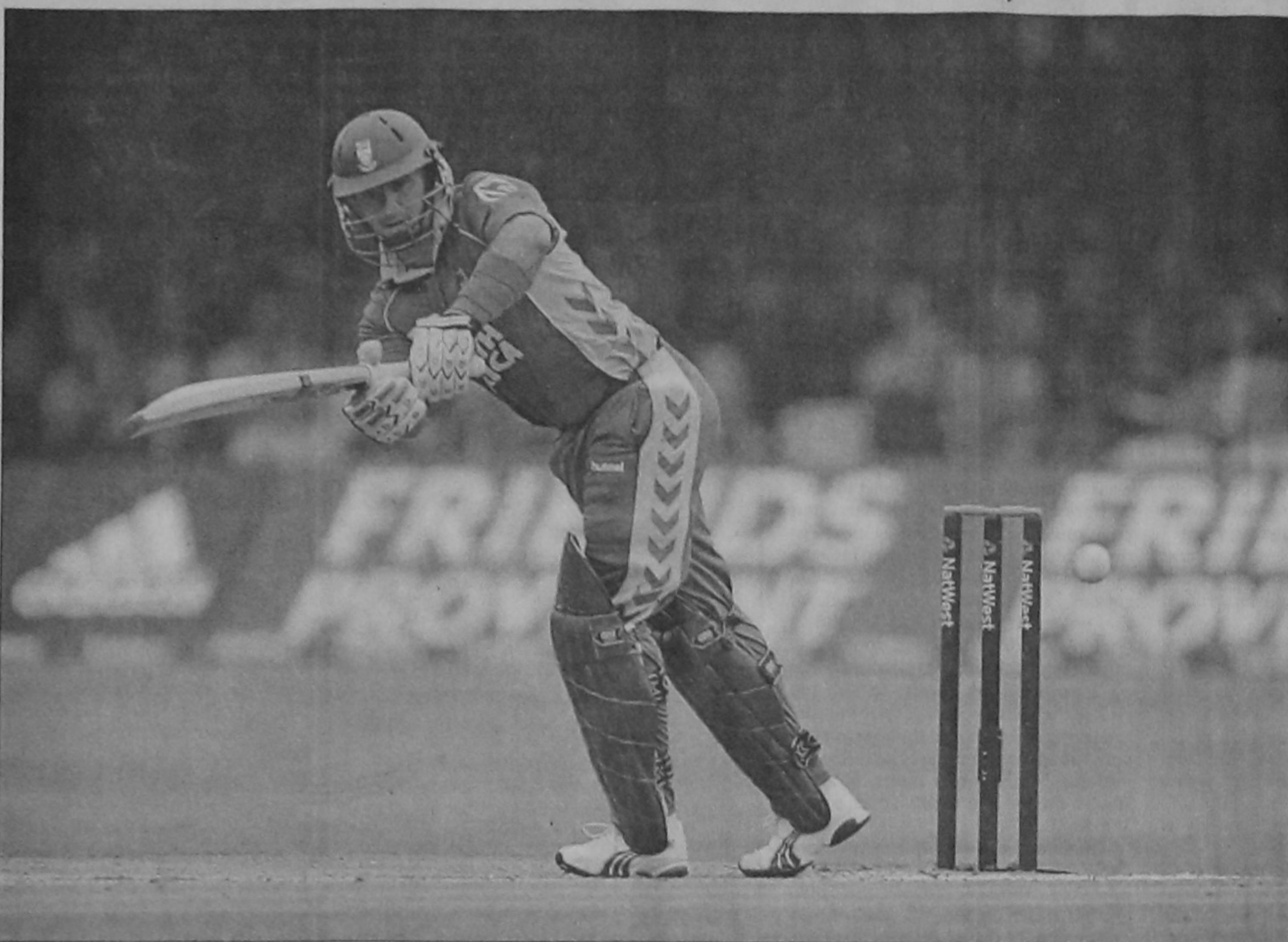
Herschelle Gibbs plays towards mid-wicket during his sparkling 74 off 75 balls during South Africa's rain-affected innings against England in the fourth one-day at Lord's in London on Sunday. The visitors scored 183-6 in 32.1 overs in a 33-overs-a-side match when rain again halted play. Johan Botha (2) and Mark Boucher (10) were at the crease.