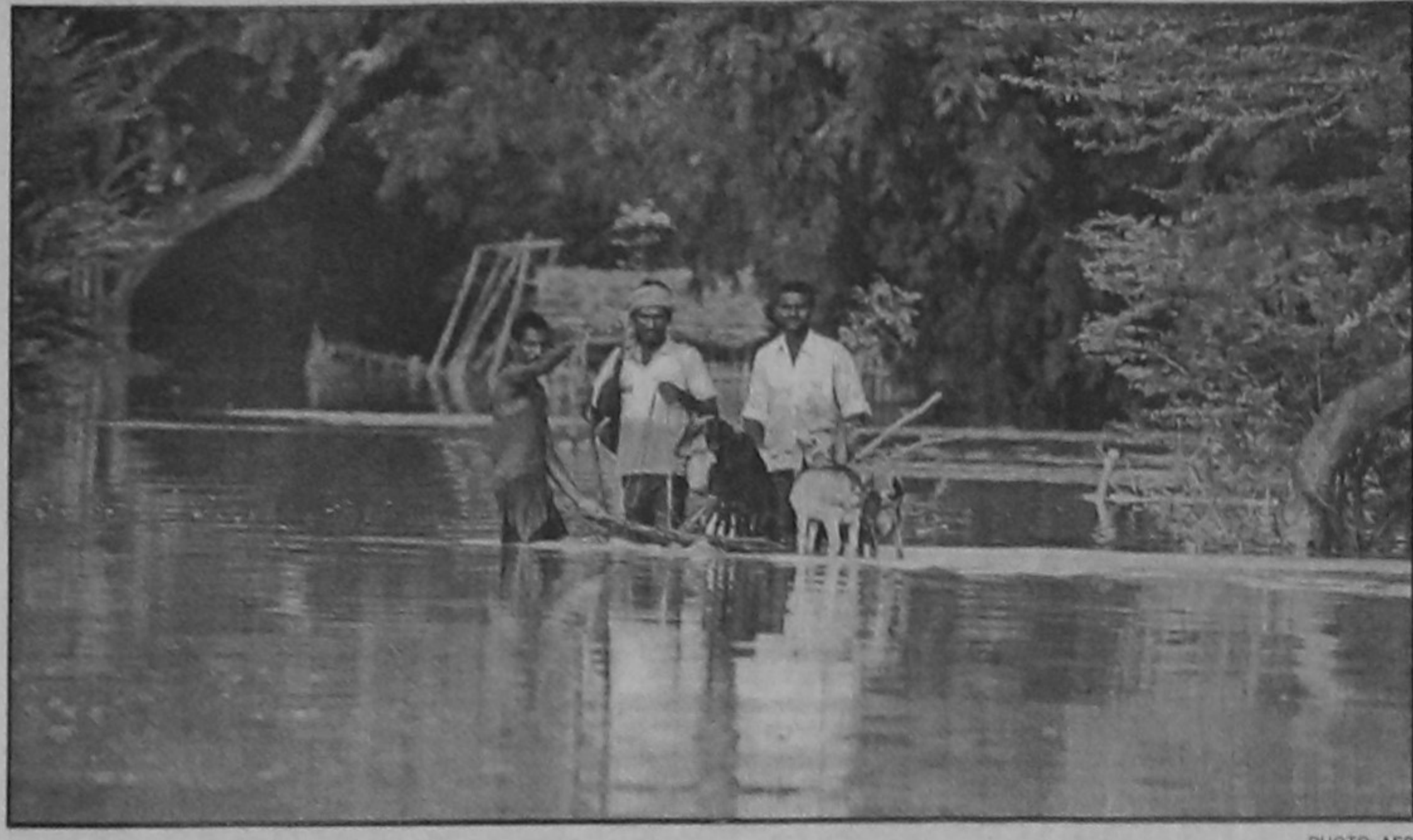
Indian flood-affected villagers transport their goats using a handmade raft in Basepura area in Poornia district, some 475km north-east of Patna Saturday. More one million people were trapped in floods in the eastern Indian state of Bihar after a rain-swollen river swerved off its course and swamped thousands of villages.