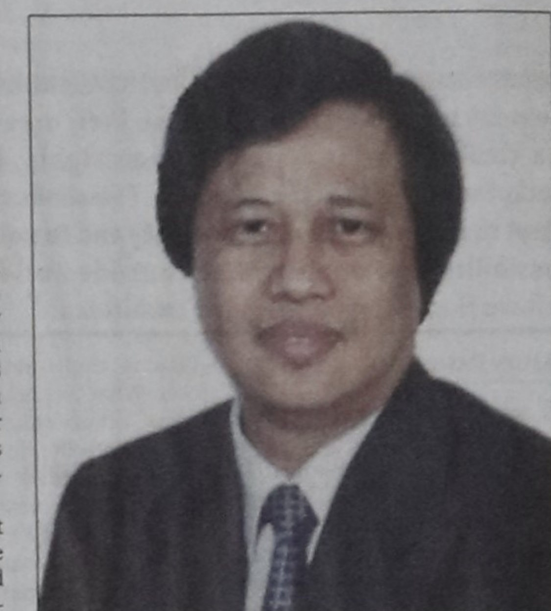
Dato' Abdul Malek Bin Abdul Aziz High Commissioner of Malaysia to Bangladesh

Warmest Felicitations to the Government and the Friendly People of Malaysia on their