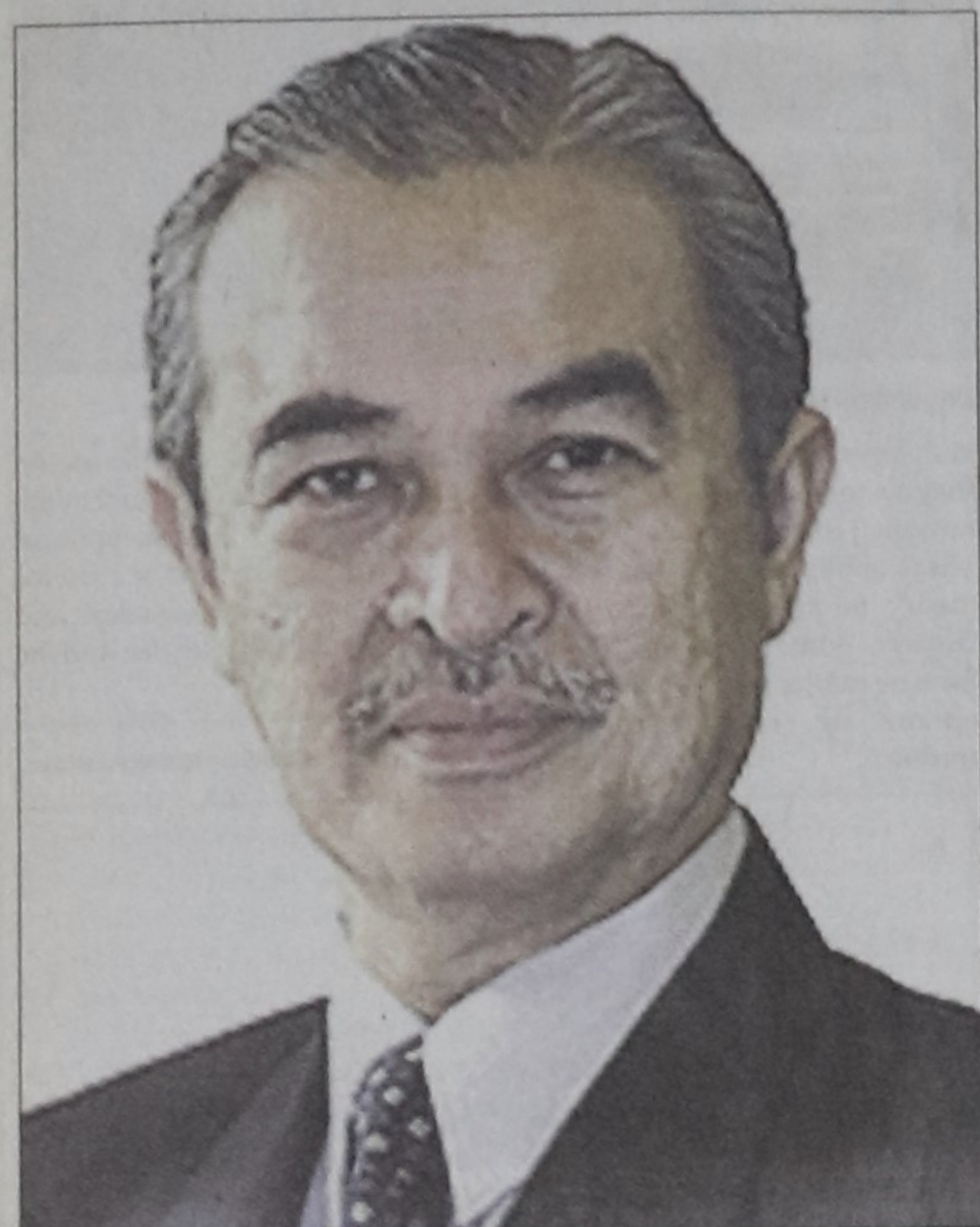
Dato' Seri Abdullah Bin Ahmad Badawi Prime Minister of Malaysia