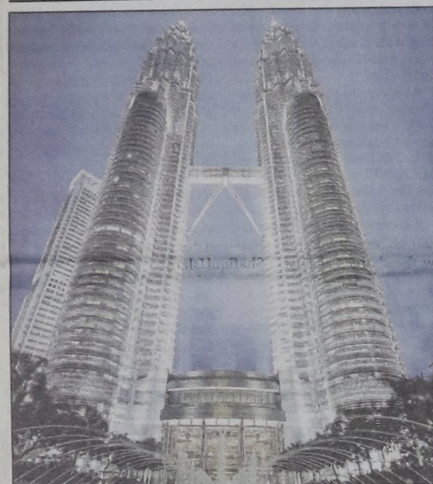
The Petronas Twin Towers reaching into the night.