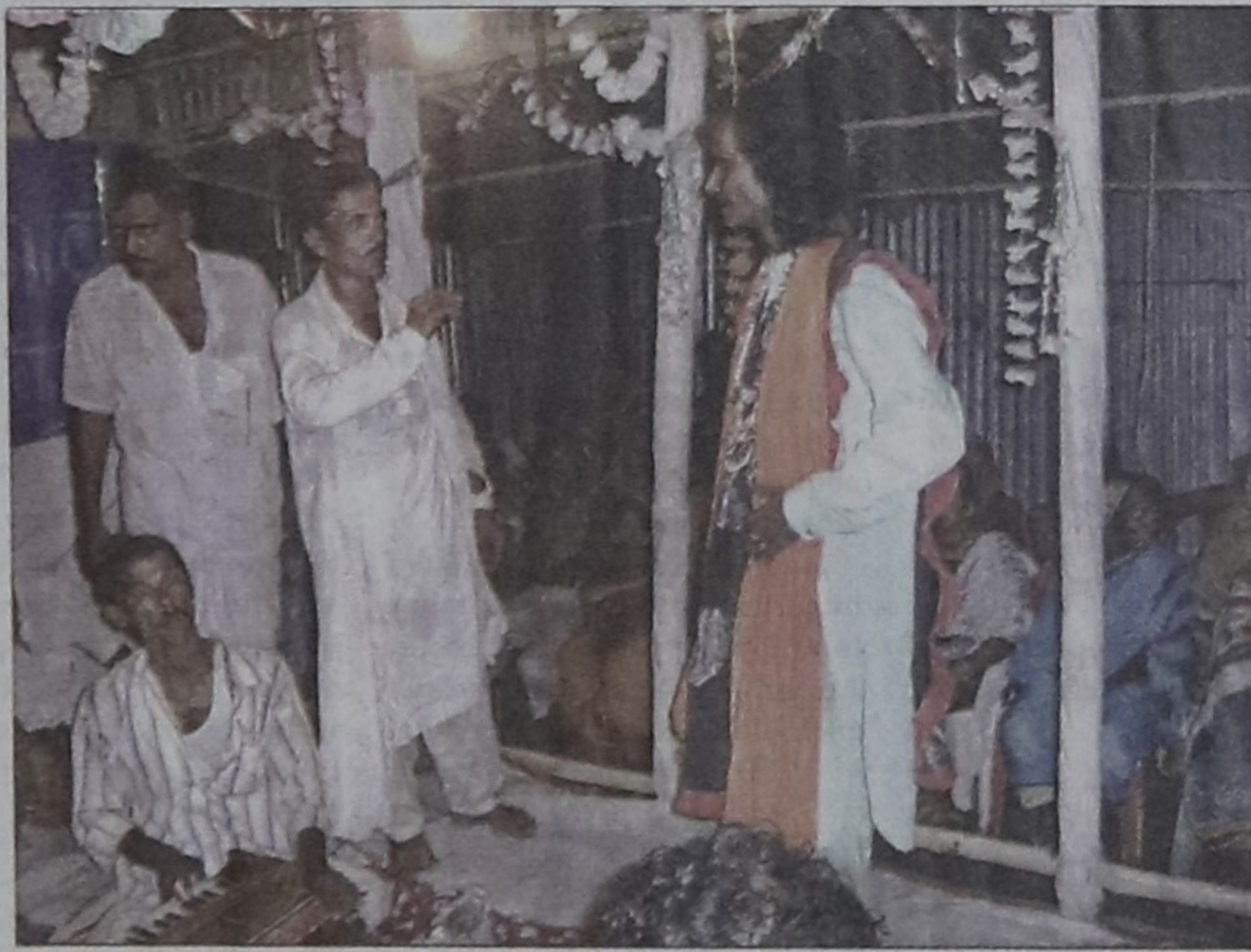
A traditional Gazir Gaan performance.

Artists use a range of musical instruments including dotara , hamonium ,