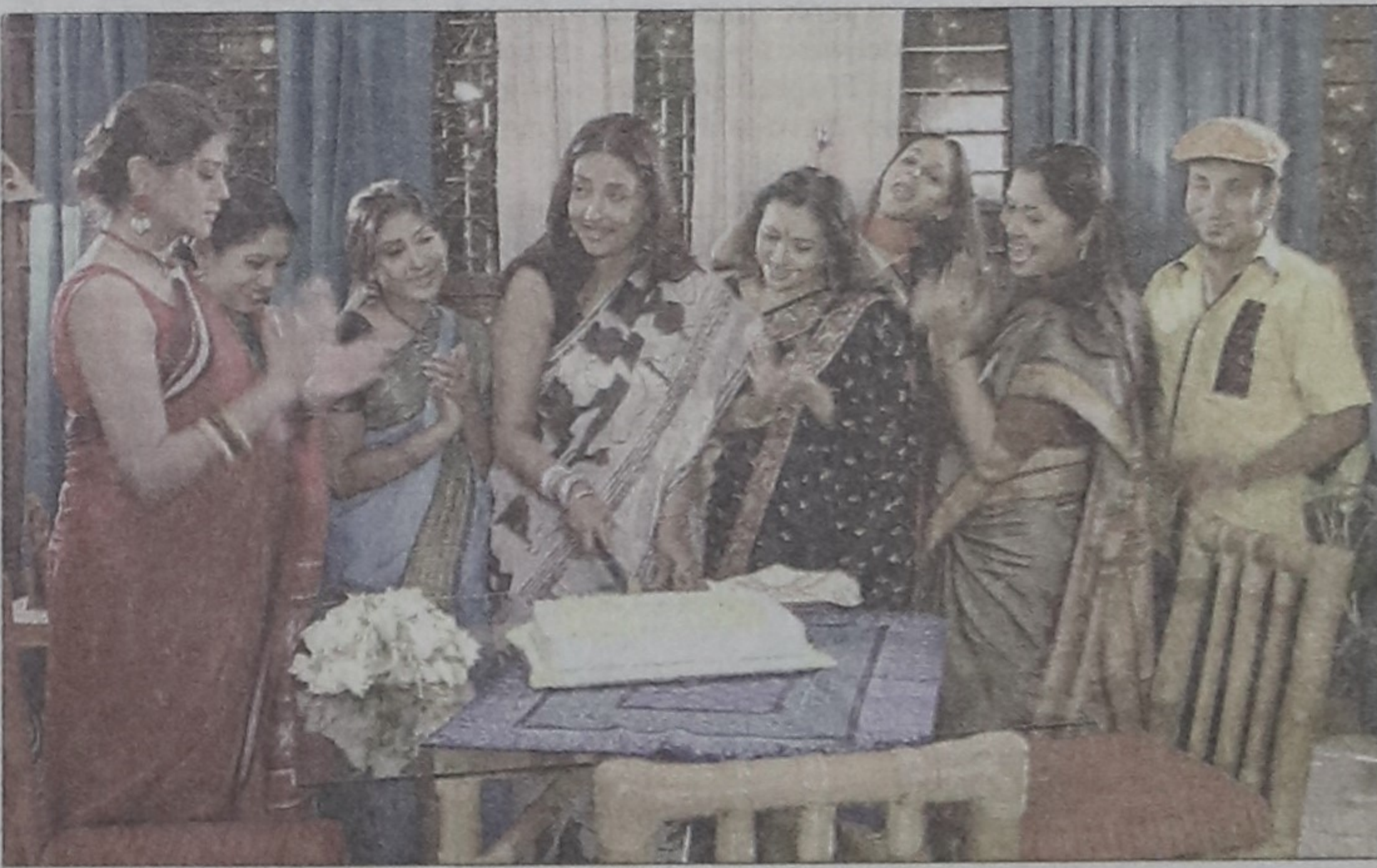
The cast of Doll's House includes celebrity actors of the country.