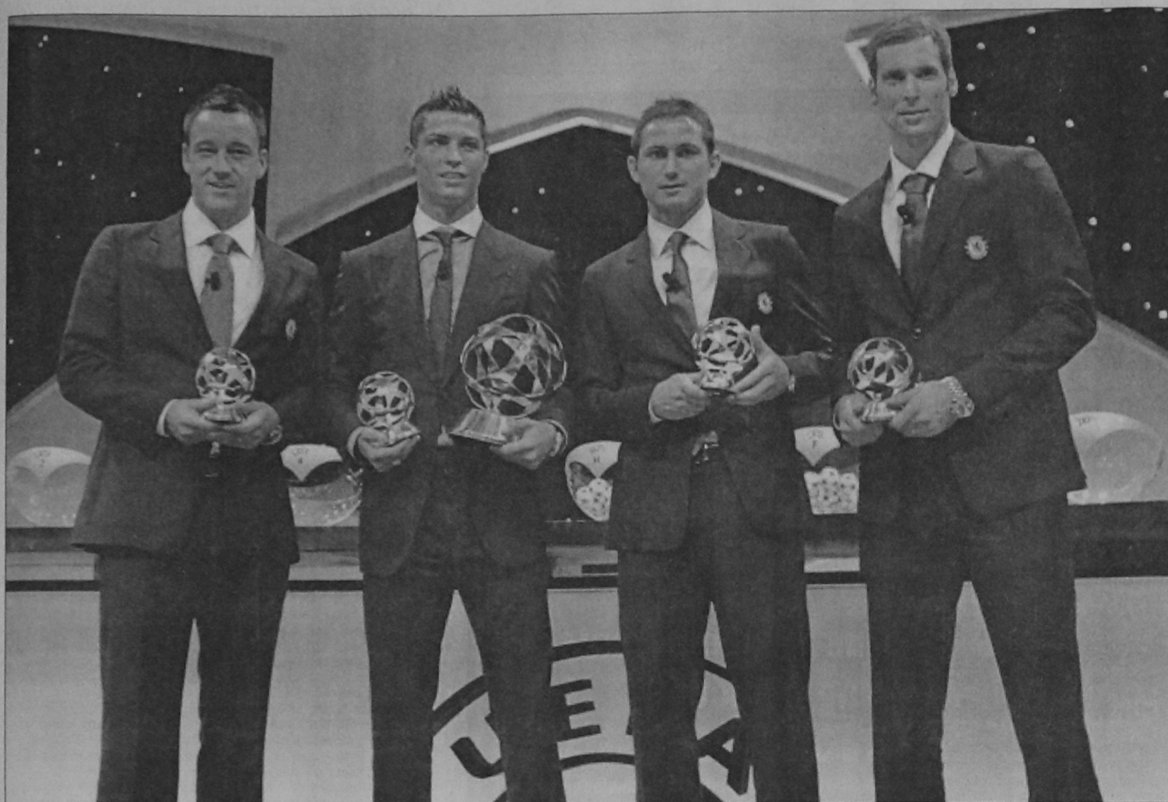
(L-R) Chelsea captain John Terry, Manchester United star Cristiano Ronaldo, Chelsea midfielder Frank Lampard and goalkeeper Petr Cech hold their awards during the draw ceremony for the 2008/2009 Champions League in Monaco on Thursday.