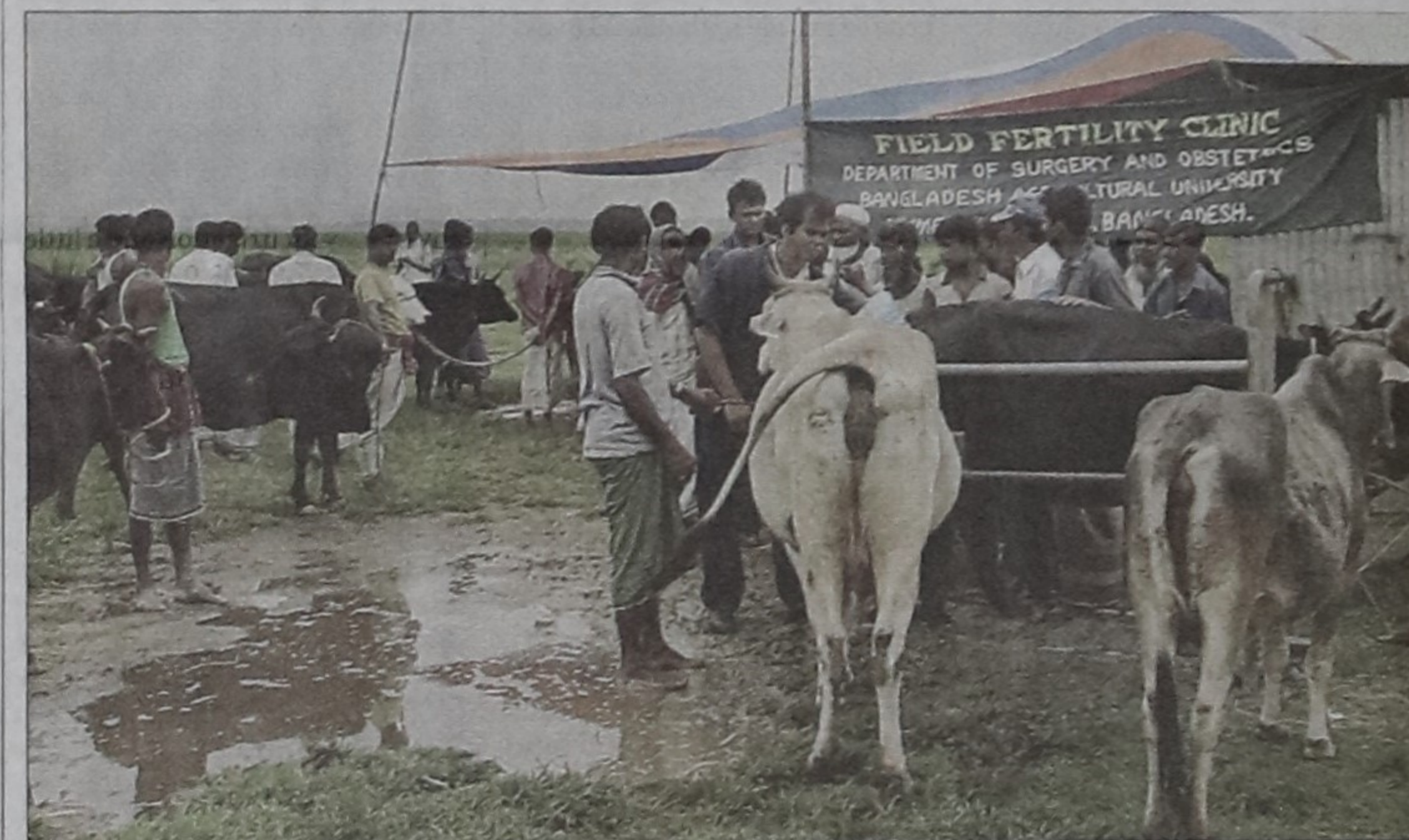
Veterinarians providing service at Field Fertility Clinic on Bangladesh Agriculture University campus in Mymensingh.

Some 200 farmers in Satkhira are supplying 1500 litres of milk to Brac's Arong daily while milk sale will start in some areas of North Bengal soon through Community Based Dairy Veterinary Service, sources said.