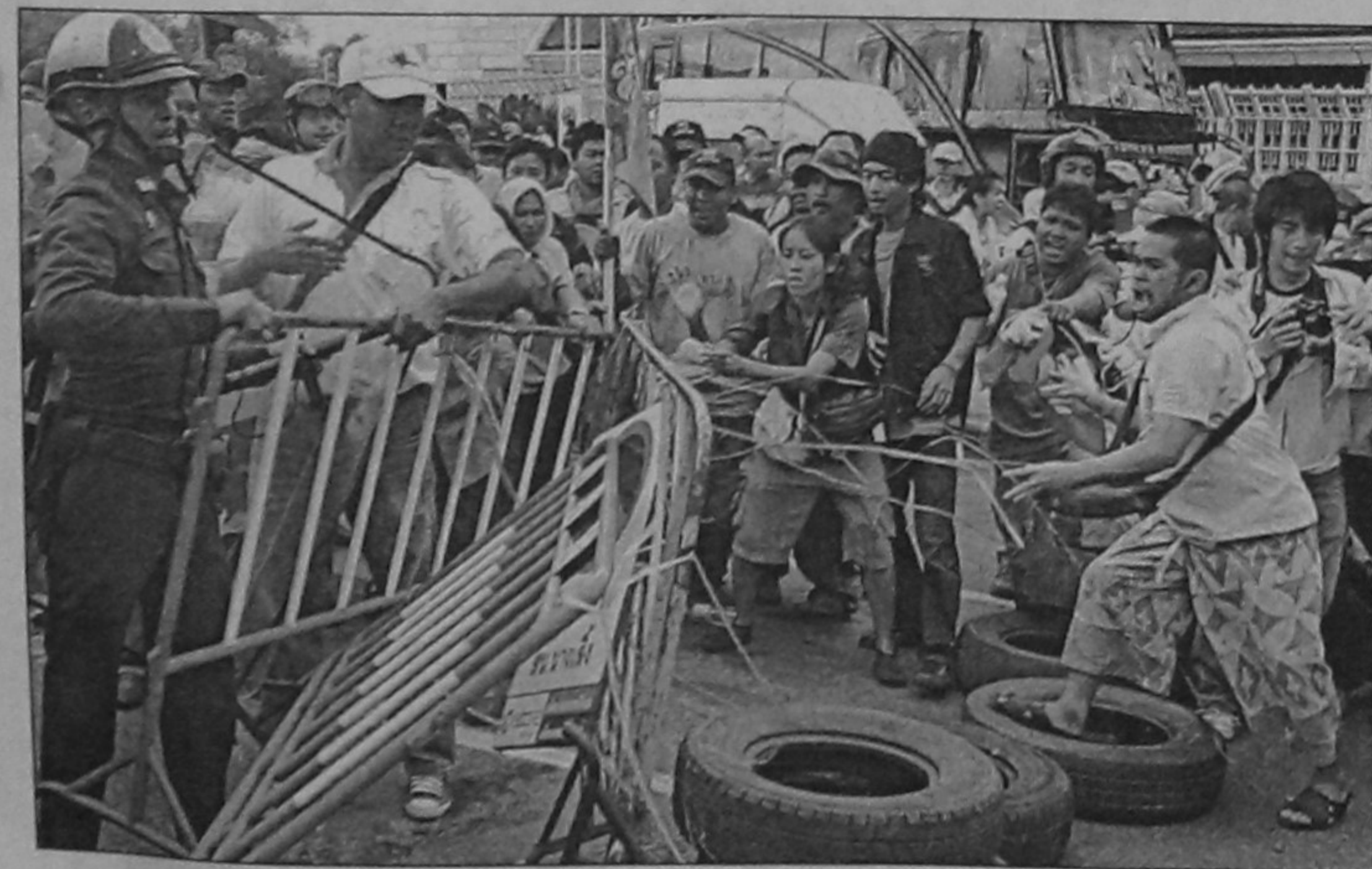
Anti-government protesters battle with Thai riot policemen during a demonstration at the Government House in Bangkok yesterday. Defiant Thai protesters scuffled with police as tensions flared on day four of the Bangkok government compound siege, but the premier vowed that his peaceful resolve would not crack.

A crowd of about 2,000 protesters left the besieged Government House compound and marched to the nearby police headquarters on Friday evening to demand the officers involved in the clashes be handed over, prompting police to fire tear gas, witnesses at the scene said.