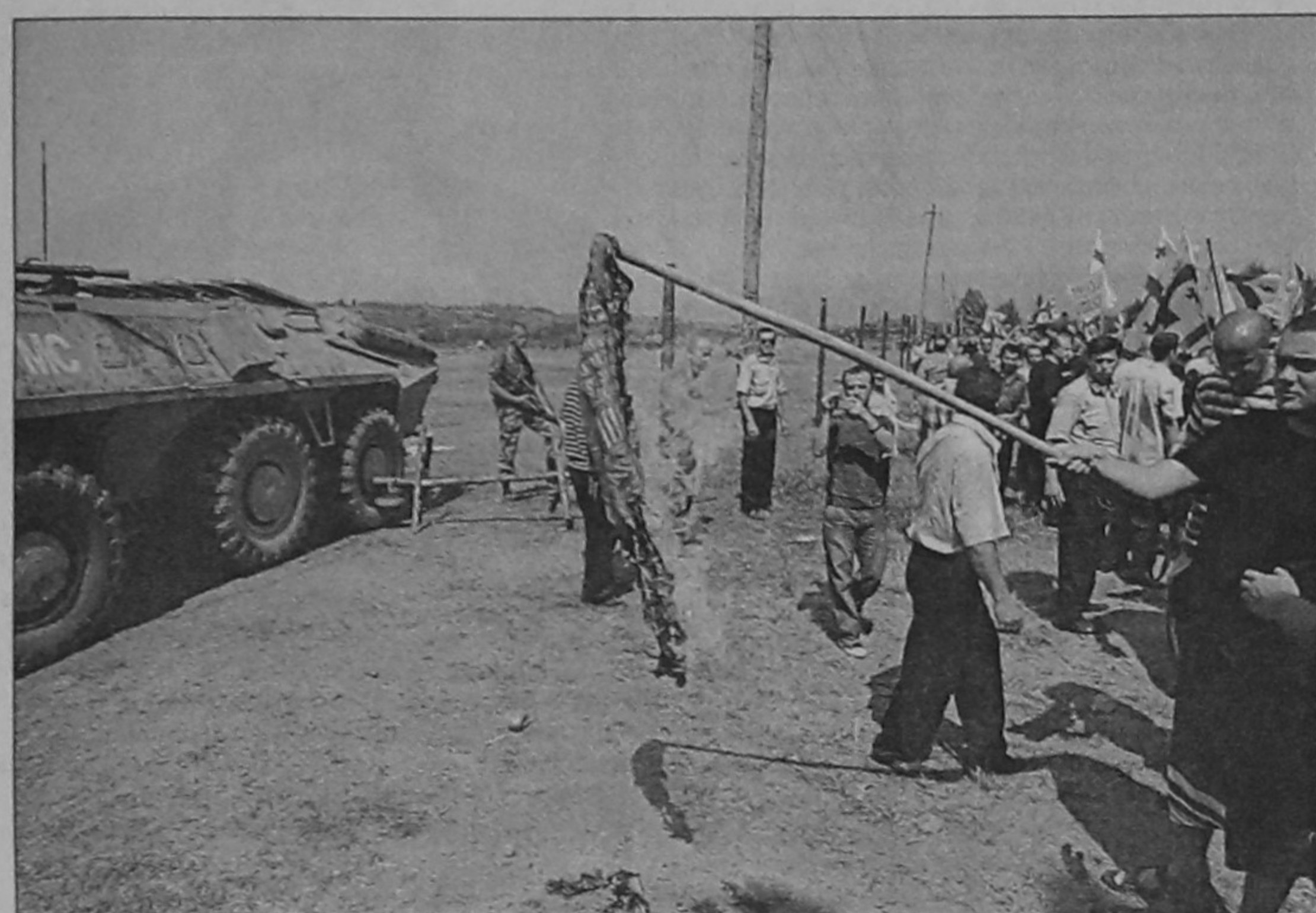
Georgians burn a former Soviet flag as they demonstrate in front of the Russian peacekeepers' base near the town of Chorchukh yesterday. About 1,000 Georgians protested Friday outside a Russian army encampment in western Georgia, calling on soldiers to leave the country.

Navana Real Estate Ltd. www.navana-realestate.com