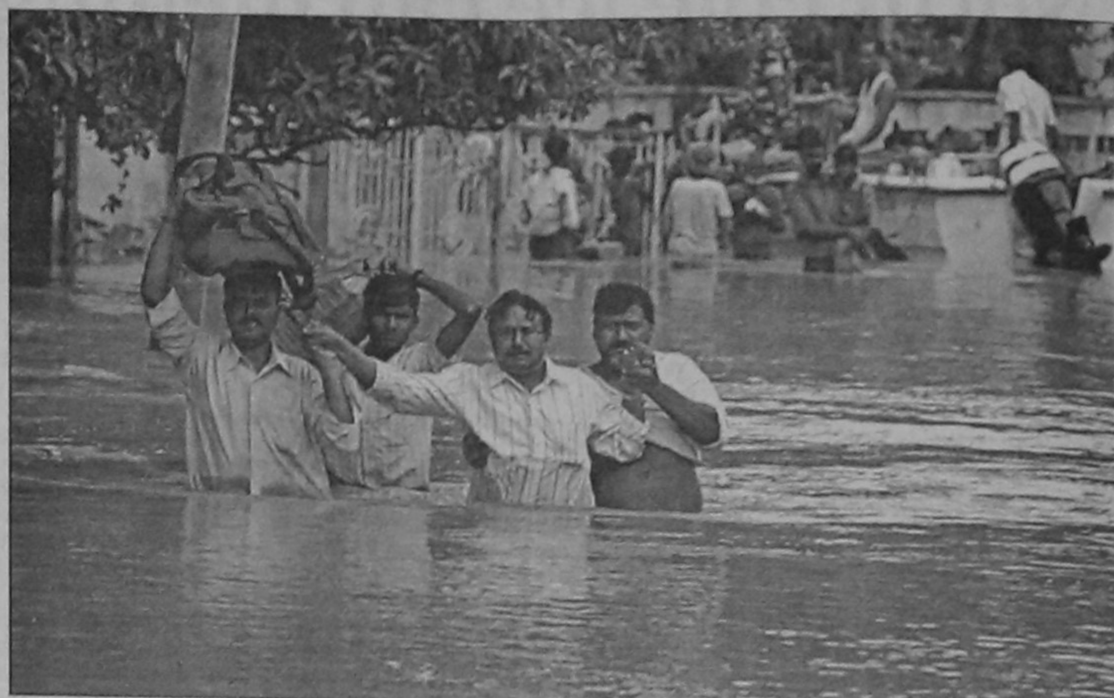
Indian flood-affected villagers wade through floodwaters during a rescue operation by the Indian army in Sitpur in Supaul district of India's northern state of Bihar, some 470km north-east of Patna on Thursday. Massive flooding in eastern India has caused a "national calamity," the prime minister said on Thursday after touring the devastated region where more than a million people remain trapped.

Tens of thousands have died on both sides since the LTTE launched a separatist campaign in 1972 for a homeland for minority Tamils in the island's north and east.