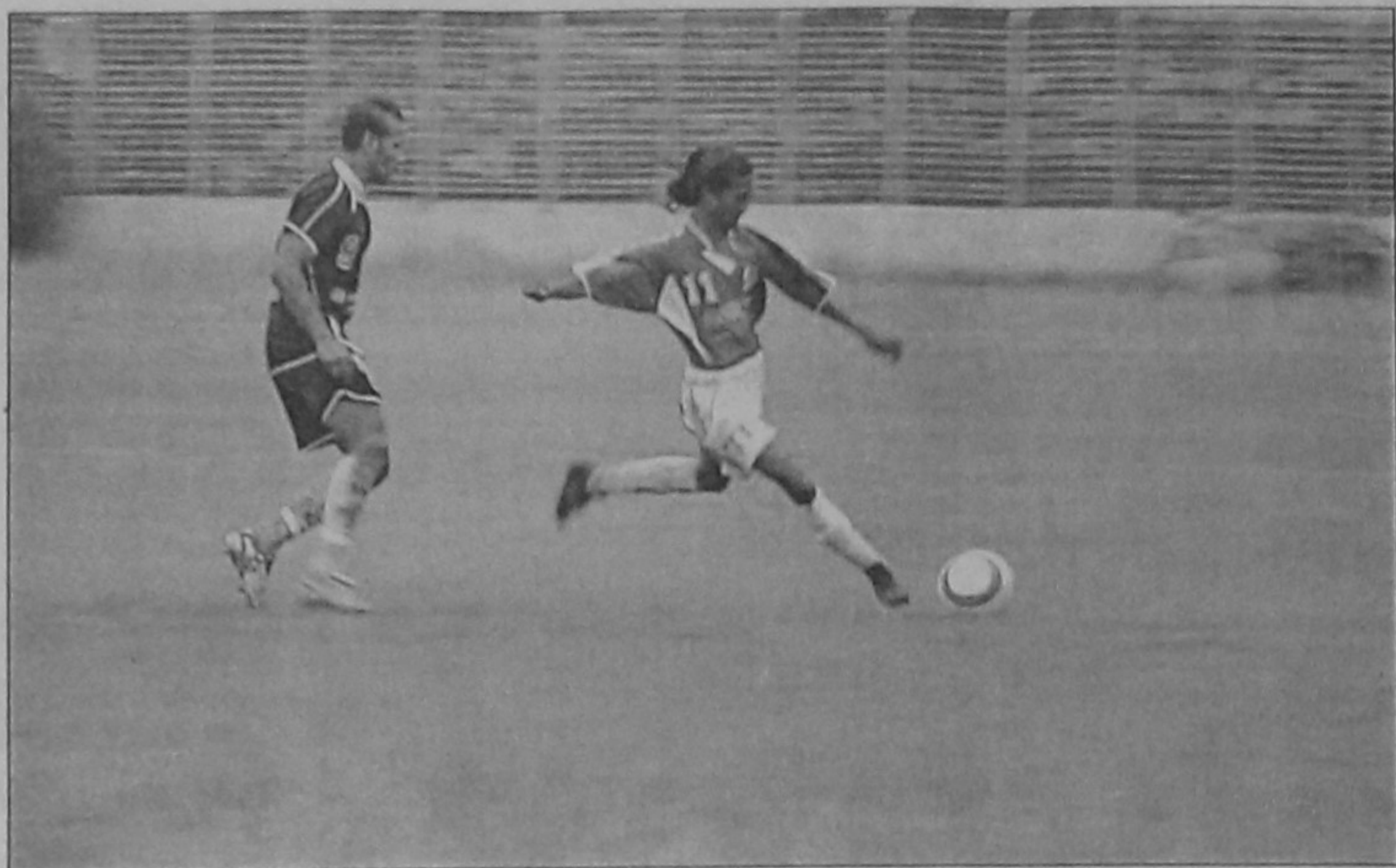
Action from yesterday's Senior Division Football League match between Agrabad Naojoan Club and Shatadal Club at the MA Aziz Stadium in Chittagong.

Although the Federation Cup has yet to draw big crowds, Bangladesh Television will telecast the two semifinals and the final live.