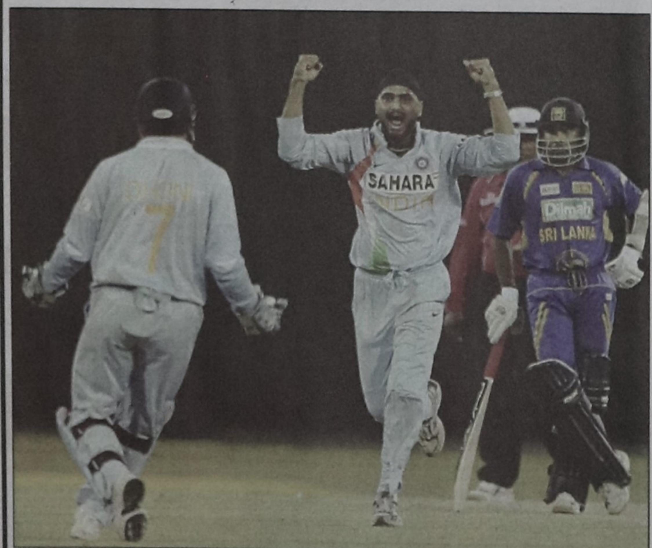
Harbhajan Singh reacts wildly after removing Sri Lanka batsman Sanath Jayasuriya (not in picture) in India's 46-run triumph in the fourth one-day at the R Premadasa Stadium in Colombo on Wednesday. The off-spinner picked up three crucial wickets in a match-winning performance.