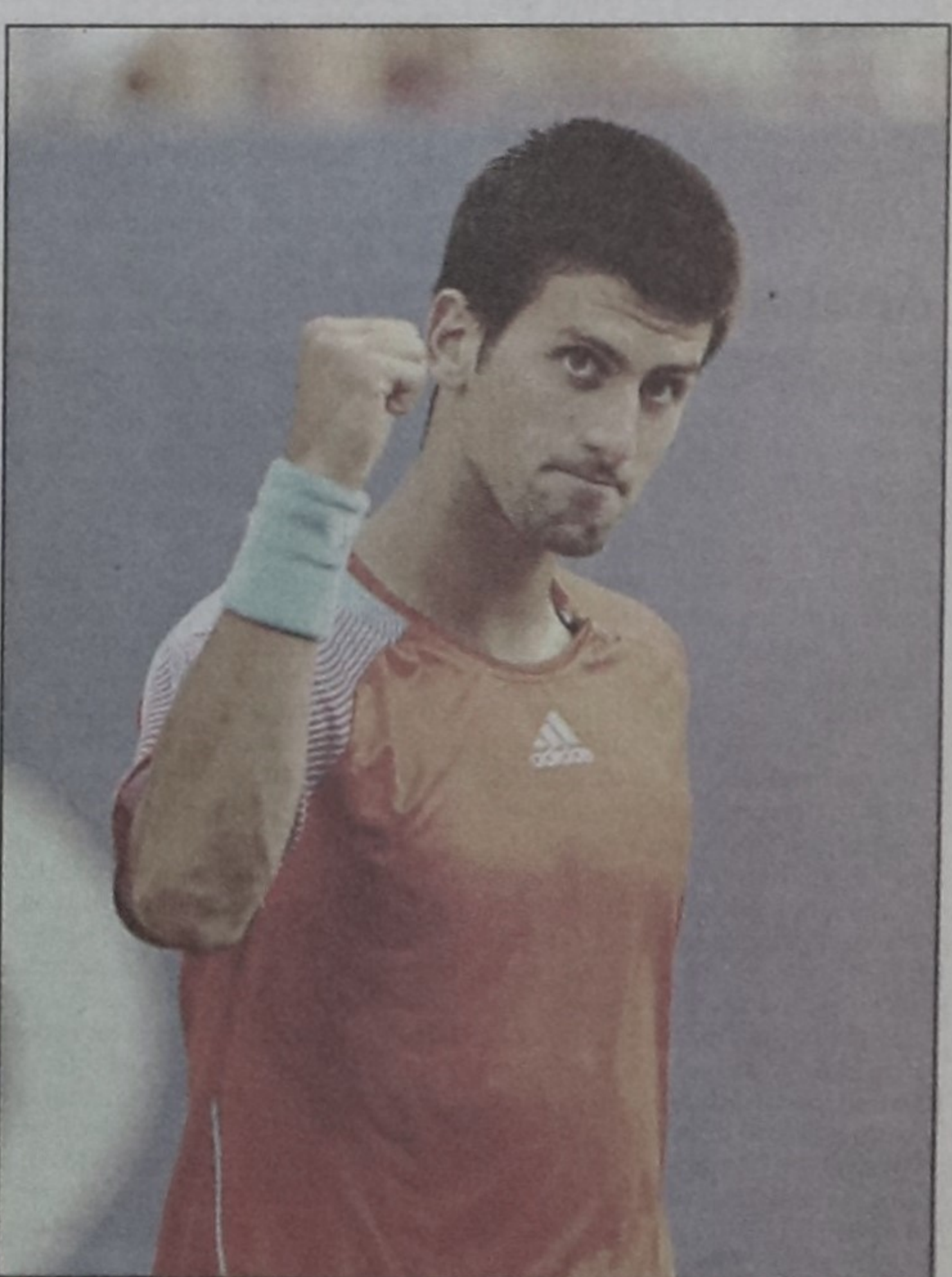
Serbian star Novak Djokovic pumps his fist after defeating Arnaud Clement of France in the first round of the US Open at Flushing Meadows on Wednesday.