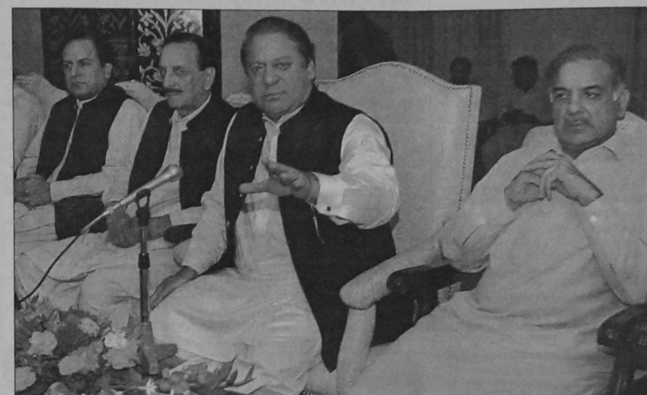
This handout picture released by the Pakistan Muslim League-Nawaz (PML-N) shows former premier Nawaz Sharif (2R), head of the second-largest party in the ruling coalition, addressing the party central executive committee meeting in Islamabad yesterday.

The channel said PML-N leader Makhdoom Javed Hashmi strongly criticised Zardari and asked the party to form a new strategy.