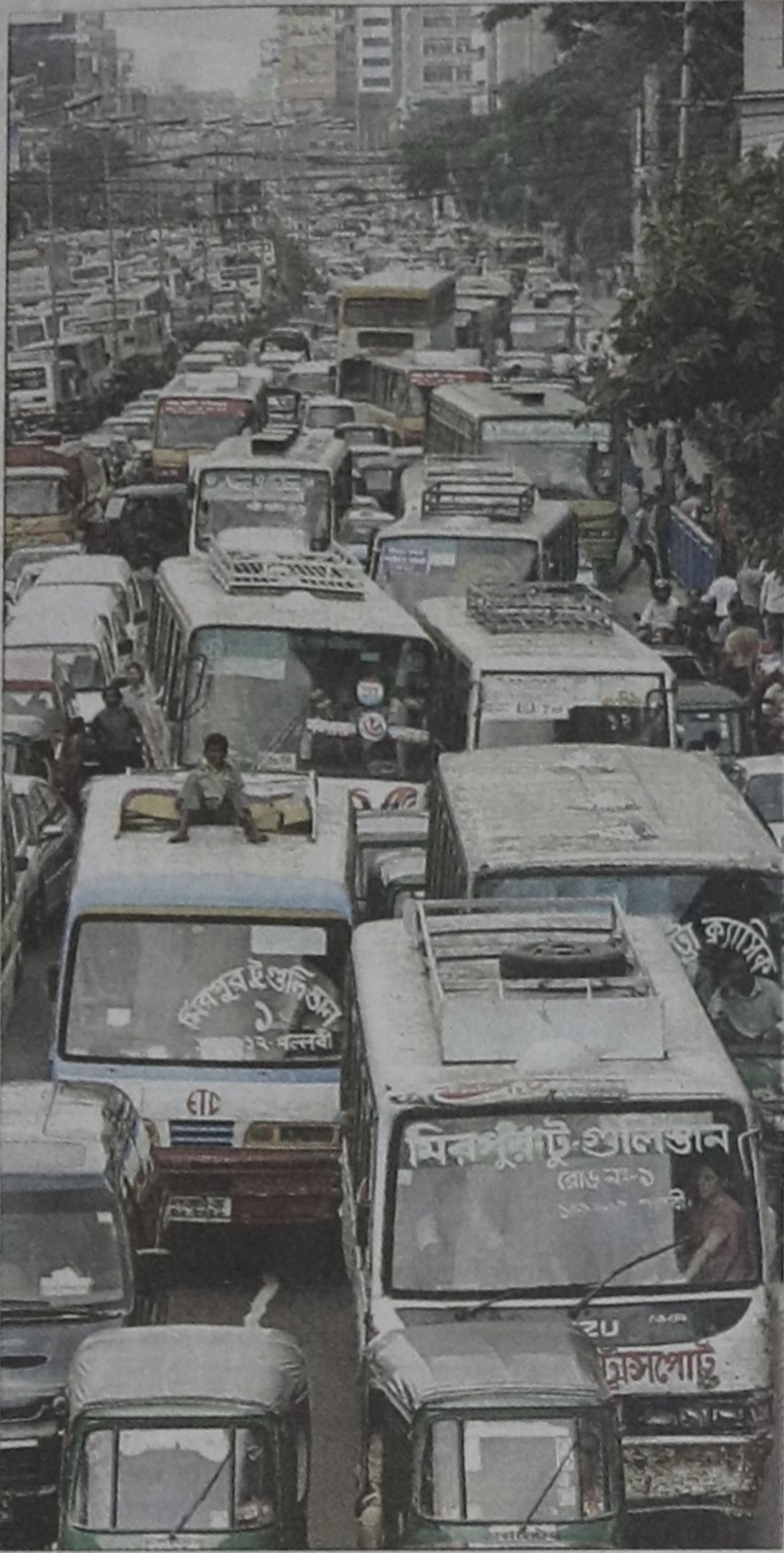
Nearly all city roads became gridlocked yesterday, causing immense suffering to the commuters. The picture was taken at Bangla Motor in the city.

Koko is now staying abroad for medical treatment.