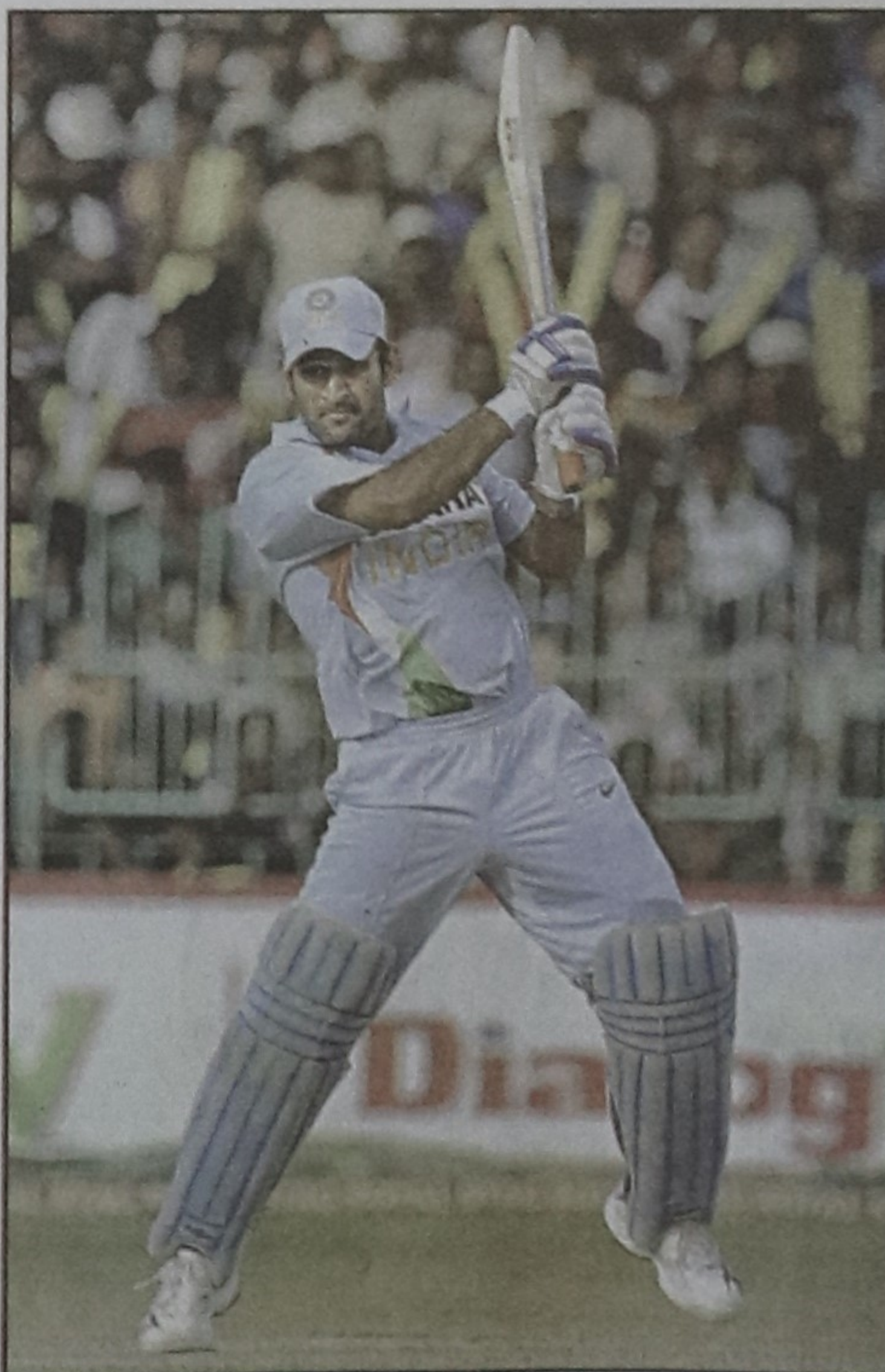
India captain Mahendra Singh Dhoni cracks the ball off the back-foot during a proficient 76 in the third one-day international at the R Premadasa Stadium in Colombo on Sunday.

The India seamers continued to exploit the conditions with Zaheer,