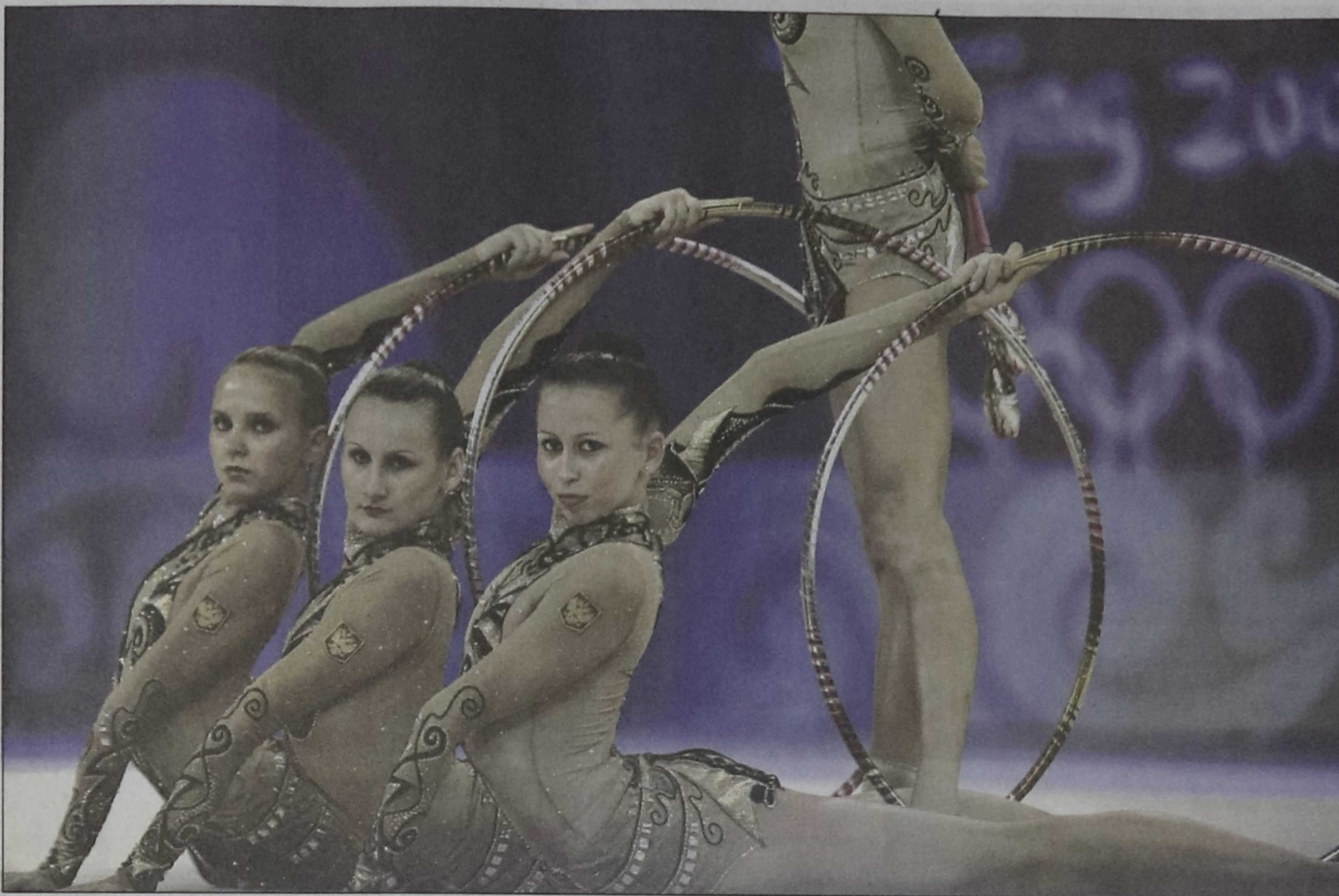
Russian gymnasts take part in the group all-around final of the rhythmic gymnastics at the Beijing 2008 Olympic Games in Beijing on Sunday.

The defending champions took the first set 25-20, but the United States came back to narrowly win the next three sets 25-22, 25-21, and 25-23.