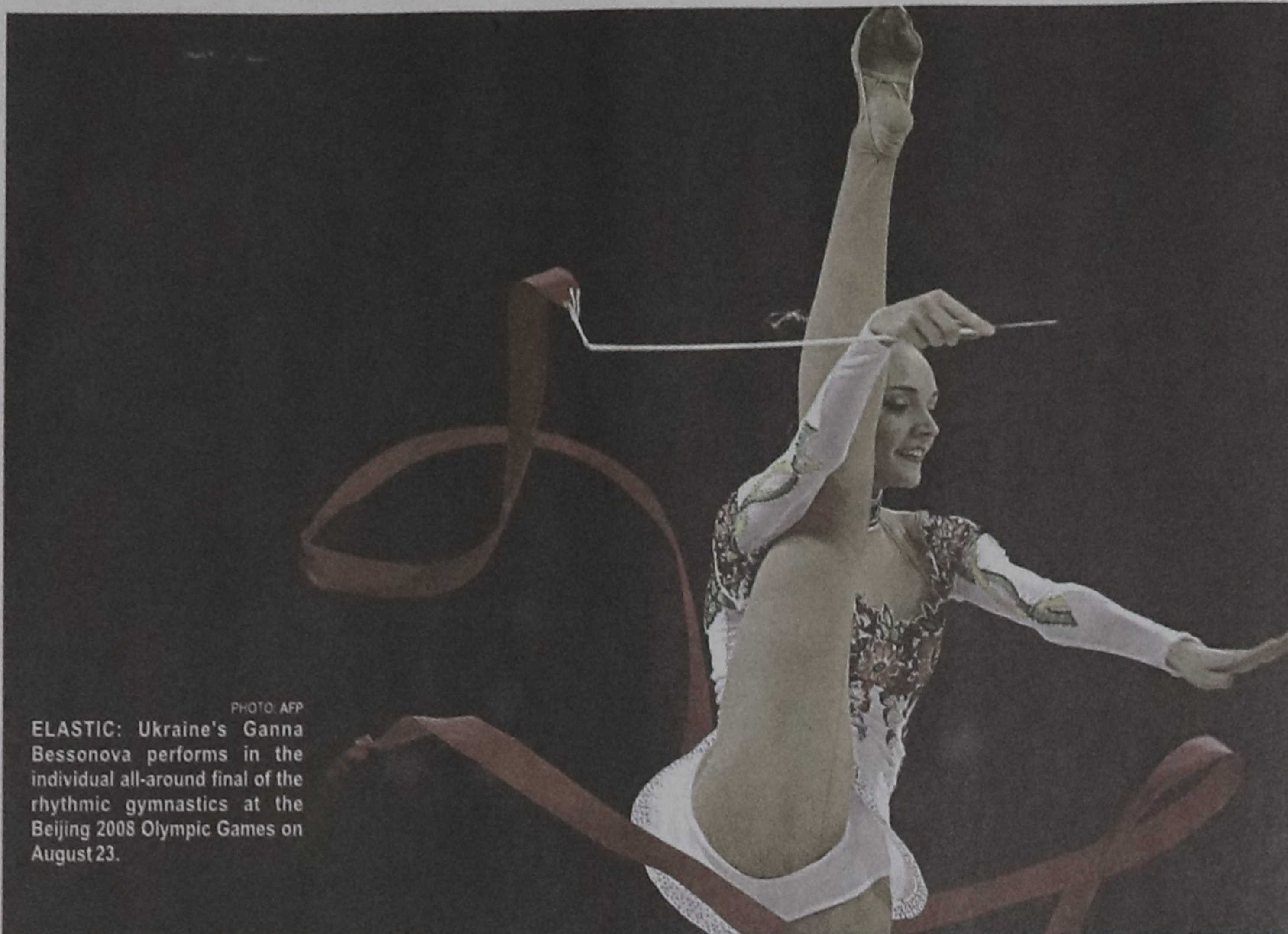
ELASTIC: Ukraine's Ganna Bessonova performs in the individual all-around final of the rhythmic gymnastics at the Beijing 2008 Olympic Games on August 23.