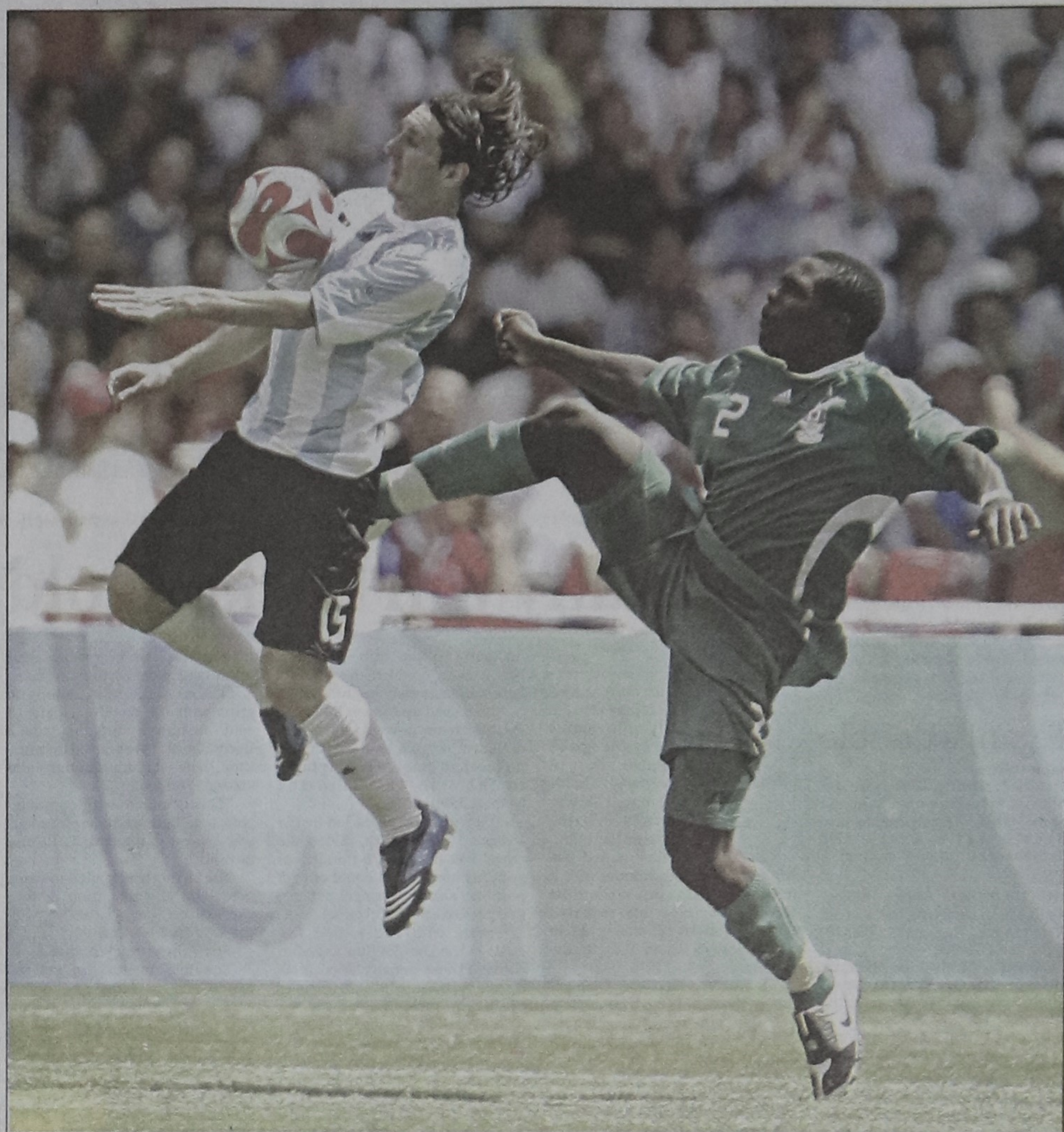
THE MESSIAH: Sublime Argentine forward Lionel Messi (L) leaps to control the ball during his side's Beijing 2008 Olympic Games men's football final against Nigeria at the Bird's Nest yesterday. Messi set up the all-important goal for Angel di Maria for Argentina's second successive Olympic gold.