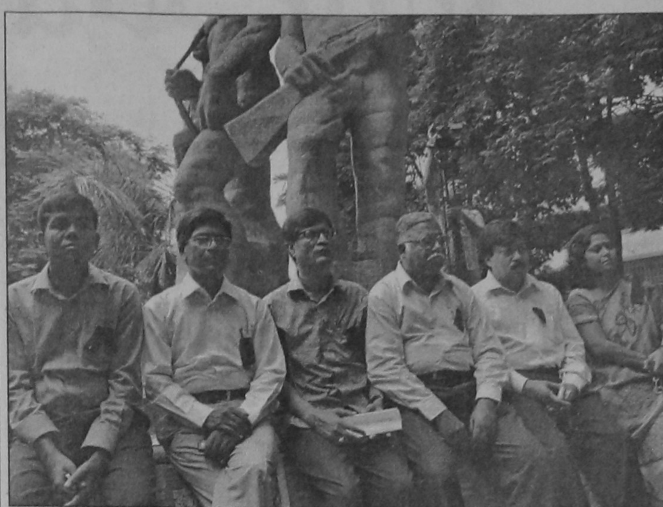
Dhaka University teachers wearing black badges stage a sit-in at the foot of Aparajevo Bangla on the campus yesterday demanding withdrawal of cases against seven students. (Story on Page 1)